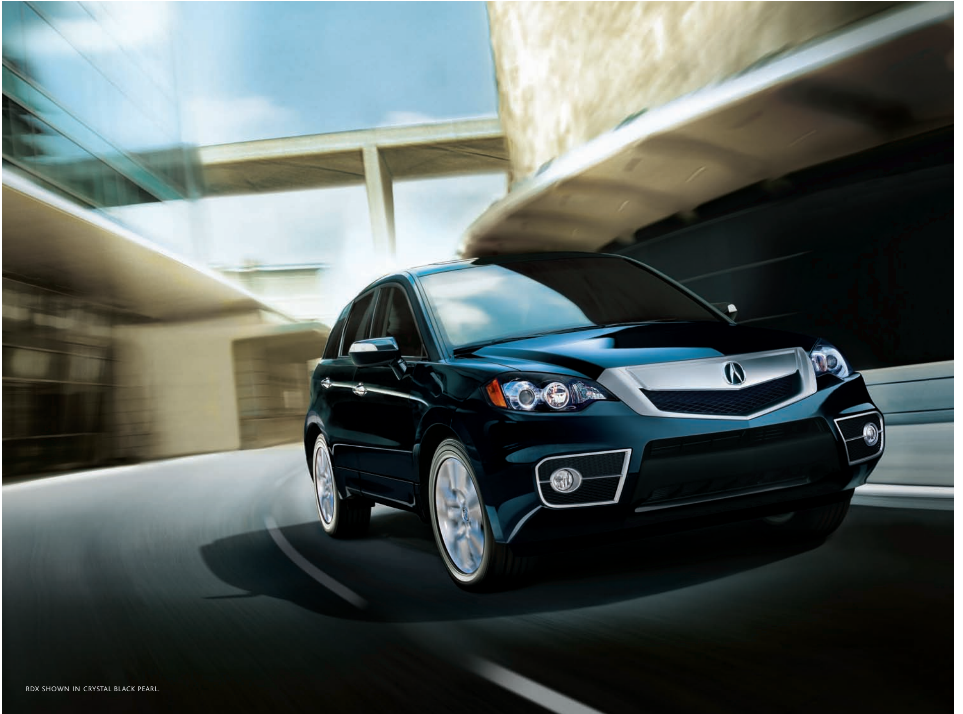
RDX SHOWN IN CRYSTAL BLACK PEARL.