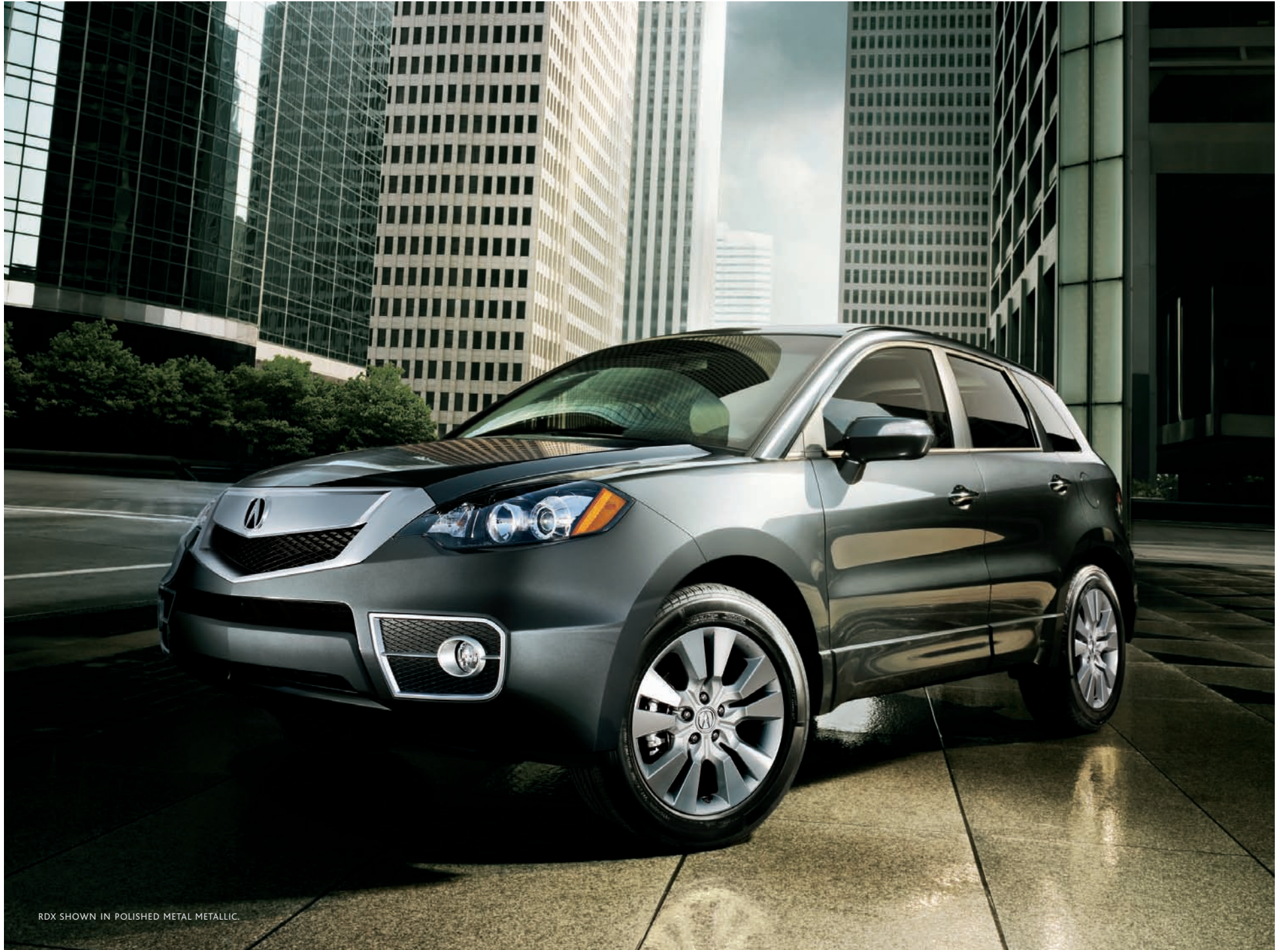
RDX SHOWN IN POLISHED METAL METALLIC.