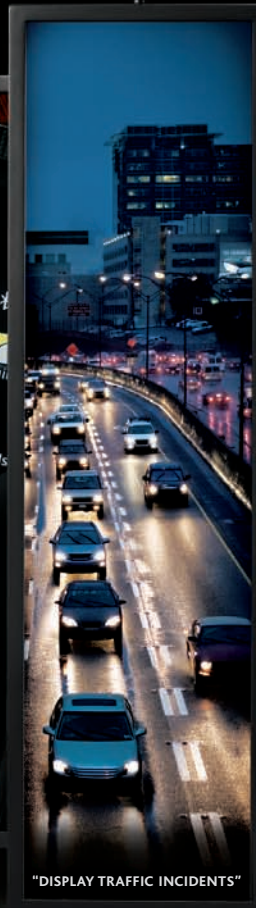
"DISPLAY TRAFFIC INCIDENTS"