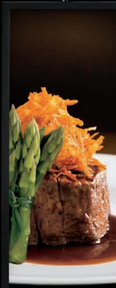
"FIND NEAREST ZAGAT RESTAURANT"