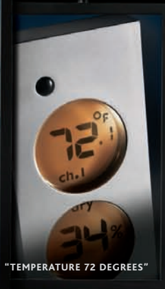
"TEMPERATURE 72 DEGREES"

ACURALINK REAL-TIME WEATHER™ ::: See current information as well as forecasts for over 75 U.S. cities right on the screen of the available navigation system. 3