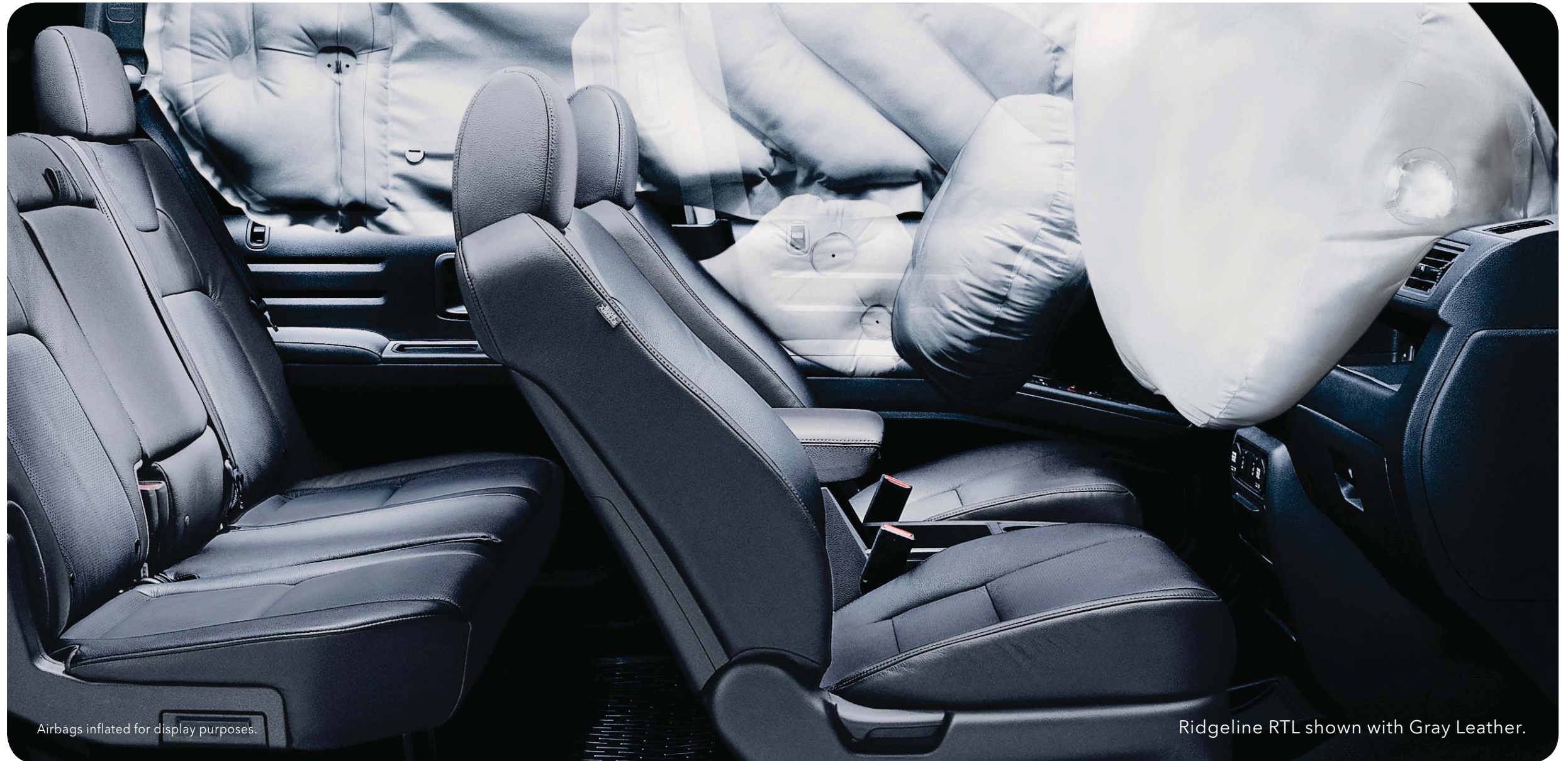
Airbags inflated for display purposes.

*Honda reminds you and your passengers to always buckle up. Children 12 and under are safest when properly restrained in the rear seat.