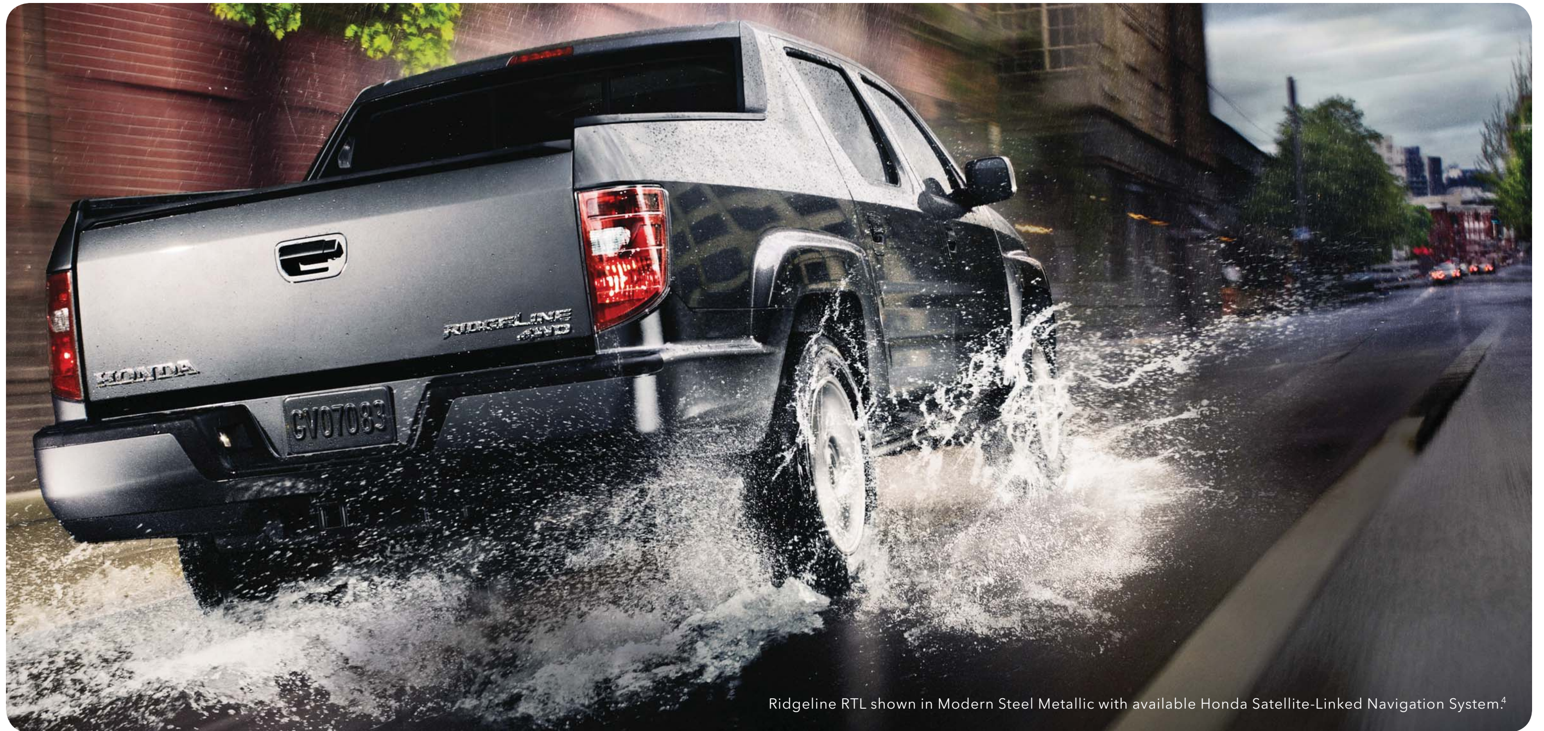
Ridgeline RTL shown in Modern Steel Metallic with available Honda Satellite-Linked Navigation System. 4