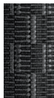
19C – Ebony**