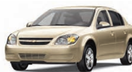
15 Sandstone Metallic 3