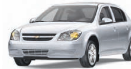
95 Ultra Silver Metallic

The exterior colours in this brochure are as close to the actual vehicle production colours as the printing process allows. For more accurate colour samples, ask your sales consultant to see the dealer showroom vehicle colour display.