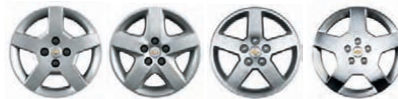
A – 15" bolt-on wheel cover B – 16" steel, High Vent wheel cover C – 16" machined-face aluminum D – 17" polished aluminum