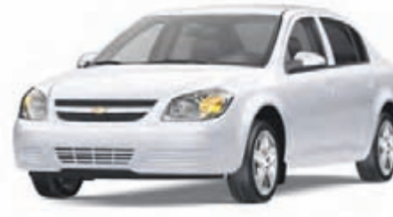
50 Summit White