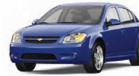
39 Blue Flash Metallic*