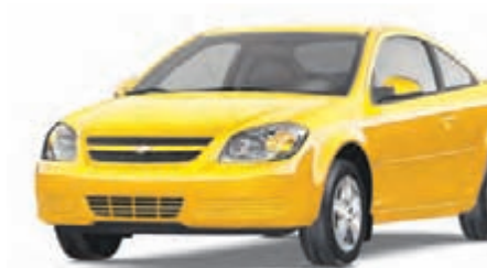
34 Rally Yellow 4