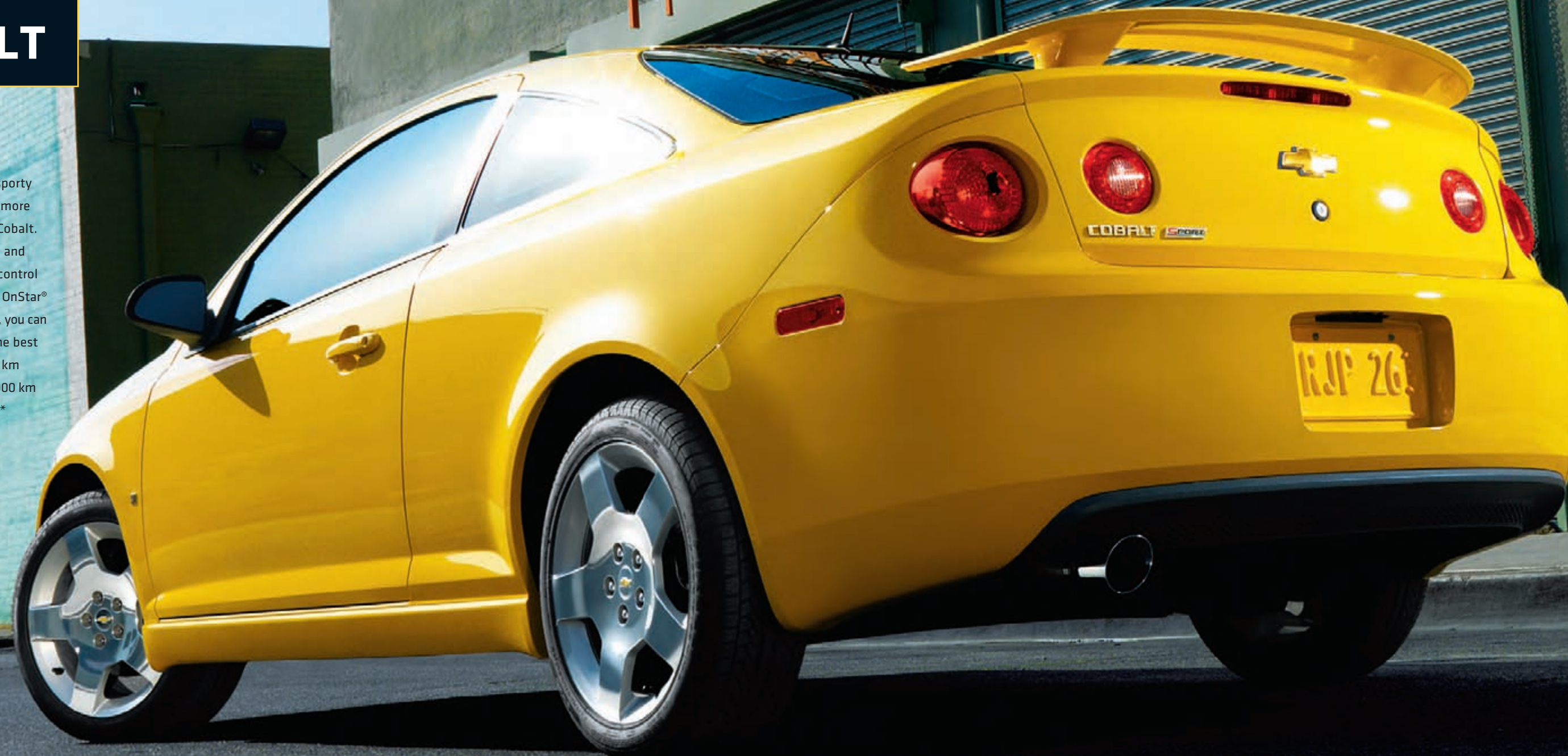
Cobalt Sport Coupe, shown in Rally Yellow.

*Whichever comes first. Conditions and limitations apply, see dealer for details.