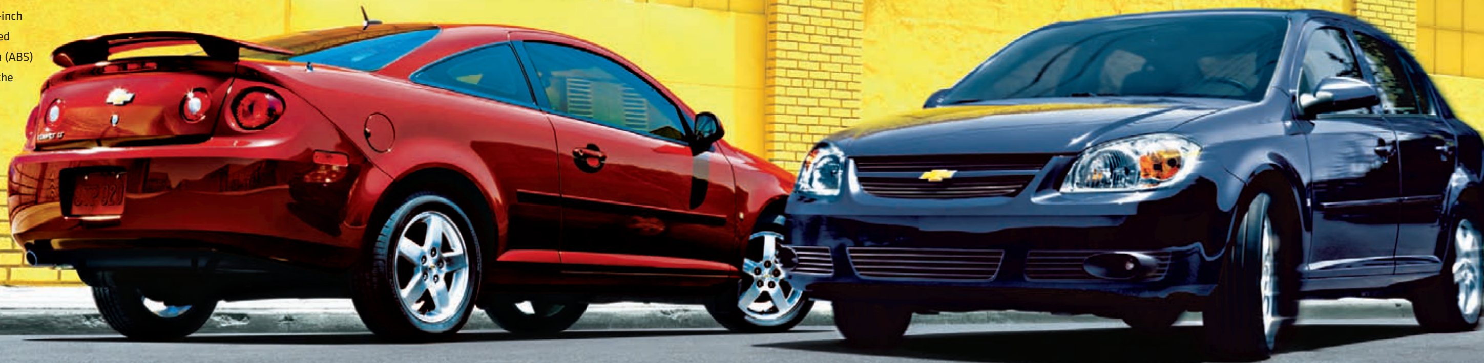
Cobalt LT Coupe, shown in available Sport Red Tintcoat and Cobalt LT Sedan, shown in Imperial Blue Metallic. Both are shown with the available Best Value Package.

*Based on 2007 Model Year data for the GM Small Car segment and the latest competitive information available at time of printing. See your dealer for details. **See your dealer for details.