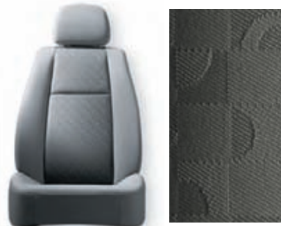
14B – Gray

Cloth Standard on LS Models. Shown in Gray