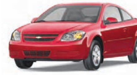
74 Victory Red