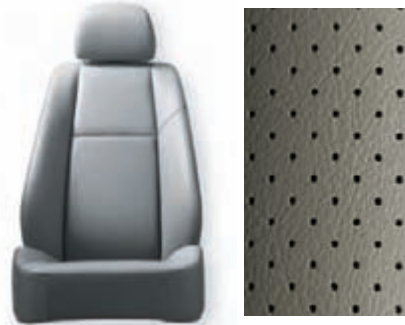
142 – Gray††

Leather-appointed Available on LT and Sport Models. Shown in Gray