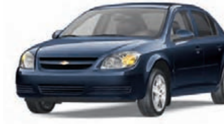
87 Slate Metallic