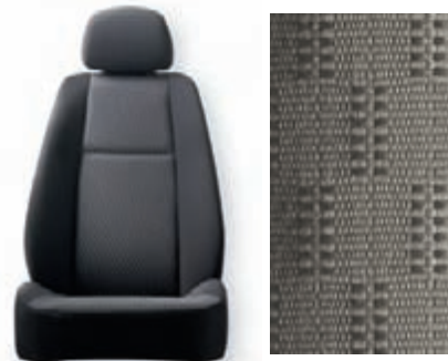
14C – Gray*

Sport Cloth Standard on LT and Sport Models. Shown in Ebony