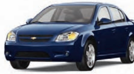
37 Imperial Blue Metallic