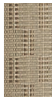
52C – Neutral†

Leather-appointed Available on LT and Sport Models. Shown in Gray