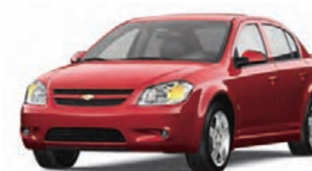
29 Sport Red Tintcoat*