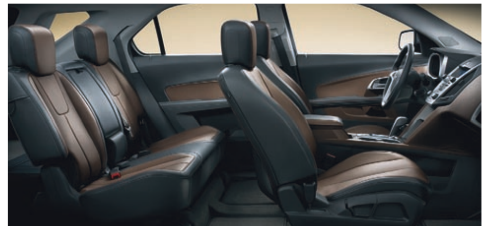
The rear seats offer the most legroom in the class¹ – more than Toyota RAV4, Honda CR-V and Ford Escape. And besides offering up to 63.7 cu. ft. of cargo space,² Equinox also has a number of storage areas and a deep center console for a laptop or purse.

We considered every aspect of the interior, including the driver seat and rear passenger legroom as well as the size and location of storage spaces. The refined DUAL COCKPIT is inviting, with subtle AMBIENT LIGHTING to help see inside the cabin during nighttime driving and chrome accents that reinforce the premium feel. The driver seat articulates and adjusts to fit you comfortably, and the tilt and telescoping steering wheel also adjusts so everything's within reach. Rear passengers can relax in a standard MULTIFLEX SLIDING REAR SEAT , which travels nearly eight inches. The