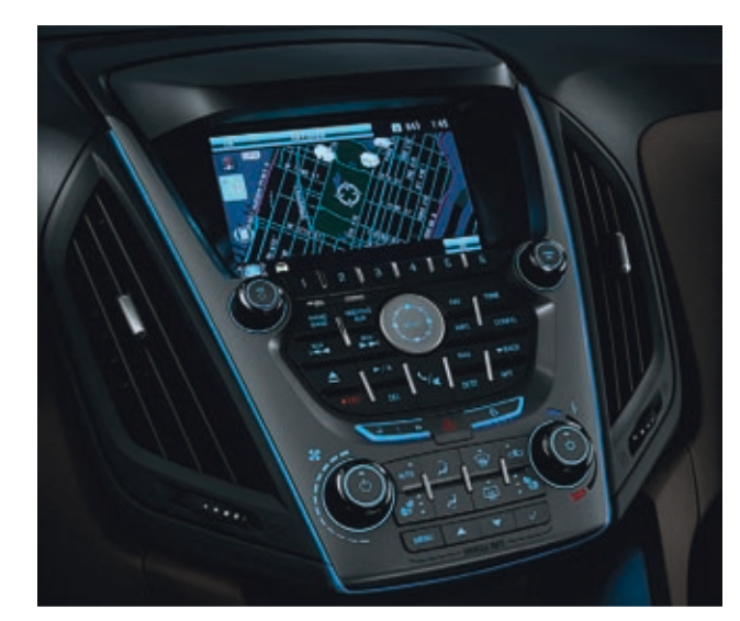
XM NavTraffic<sup>6</sup> enhances your vehicle's available GPS navigation system by showing real-time traffic data when it's needed most – while you're driving. It can alert you to construction and accidents to help keep you on time.

Equinox offers many surprising features to make your life easier. Its available POWER-PROGRAMMABLE LIFTGATE adjusts to your height and can be conveniently opened by remote. An available advanced remote start