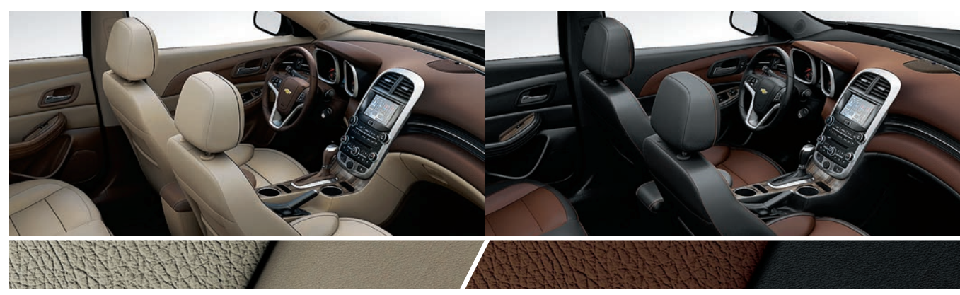
Cocoa/Light Neutral Leather Appointments with Vinyl Perimeter Accents<sup>4,5</sup>