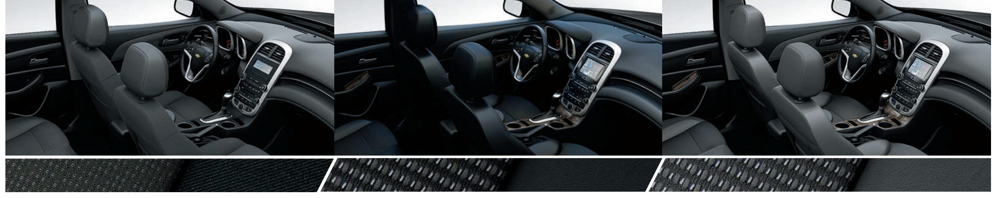
Jet Black/Titanium-Color Cloth¹ Jet Black/Titanium Cloth² Jet Black/Titanium Cloth² Jet Black/Titanium Color Premium Cloth²