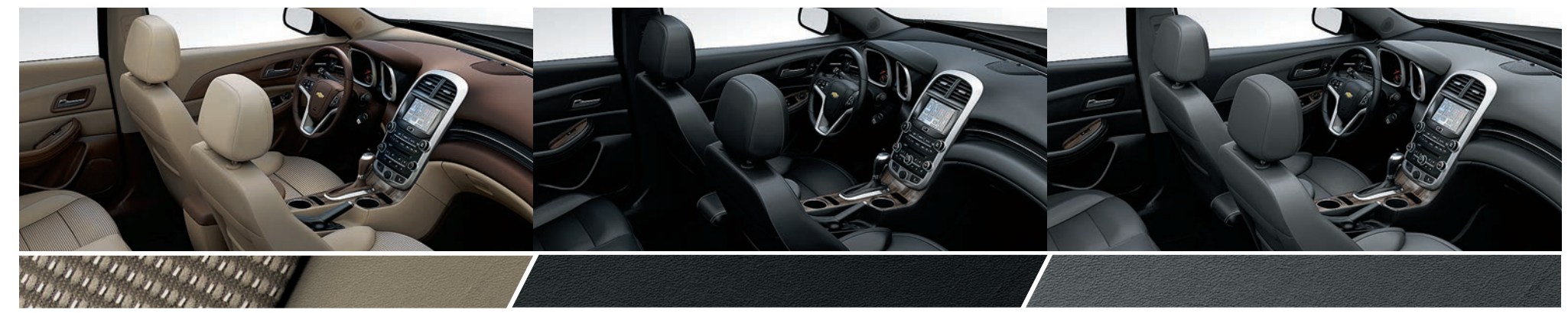
Cocoa/Light Neutral Premium Cloth<sup>2</sup>