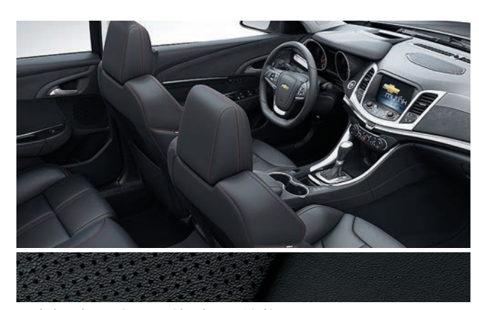
Jet Black Leather Appointments with Red Accent Stitching