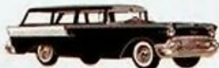
"ONE-FIFTY" HANDYMAN STATION WAGON 2-door 6-passenger