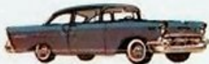
"ONE-FIFTY" UTILITY SEDAN