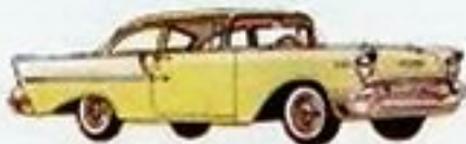
"ONE-FIFTY" 2-DOOR SEDAN