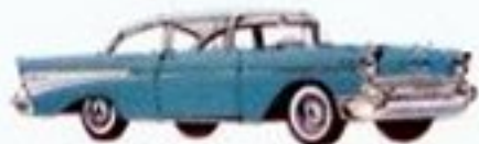
BEL AIR 2-DOOR SEDAN

Here is a dream car come true! This sports model station wagon features foam rubber in seat cushions and rooney comfort for six, with thick carpets and luxurious trim—yet it's practical as only a station wagon can be.