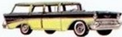
"TWO-TEN" TOWNSMAN STATION WAGON