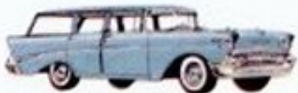
"TWO-TEN" BEAUVILLE STATION WAGON 4-door 3-passenger