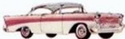
"TWO-TEN" SPORT COUPE