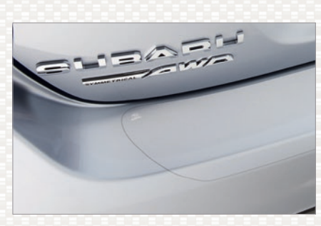
Rear Bumper Appliqué. Clear, scratchresistant vinyl film helps to protect bumper upper surface and leading edge. Includes a discrete pearl-colored Subaru logo.