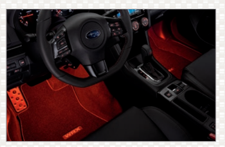
Footwell Illumination Kit. Casts a soft red or blue glow onto the front floor area.