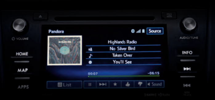
SUBARU STARLINK™ Multimedia