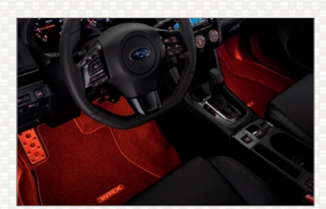
Footwell Illumination Kit. Casts a soft red or blue glow onto the front floor area.