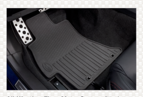
All-Weather Floor Mats. Custom-fitted, heavy-gauge floor mats help protect the vehicle carpet from sand, dirt and moisture. Not intended for use on top of Carpeted Floor Mats

Excludes models equipped with Harman Kardon® audio.