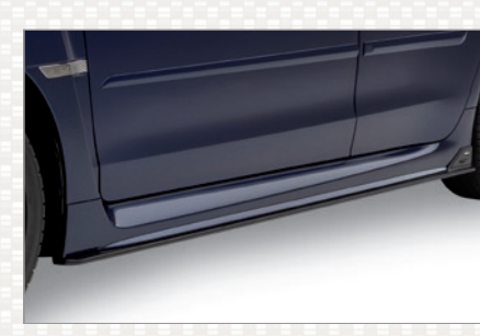
STI Under Spoiler – Side. Give your vehicle a ground-hugging look down the rocker panels of the WRX or WRX STI. Kit includes both left and right side under spoilers. Includes STI logo.