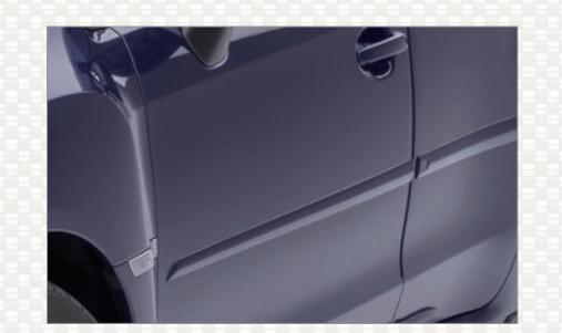
Body Side Molding. Attractive, color-matched moldings coordinate with the styling of the vehicle while helping to protect doors from unsightly dings.