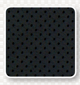
Carbon Black Leather (CBL)