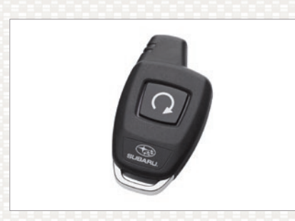
Remote Engine Starter. Allows the vehicle to be started at the push of a button from outside the vehicle. Preset the heating or air conditioner controls to help bring the interior temperature to a more comfortable level prior to entry. Smart Engine Start works in conjunction with the Keyless Access and Smart system. Operating distance is up to 30 feet away, depending on vehicle obstructions.

| For a complete list of available accessories, visit your local Subaru retailer or visit www.subaru.com