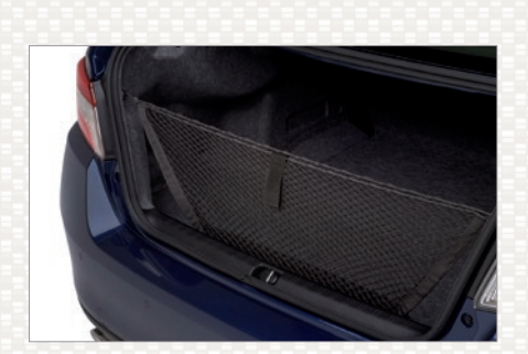
Cargo Net. Neatly holds cargo and prevents it from sliding while the vehicle is in motion.