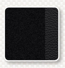
Black Ultrasuede®/ Carbon Black Leather (BU)