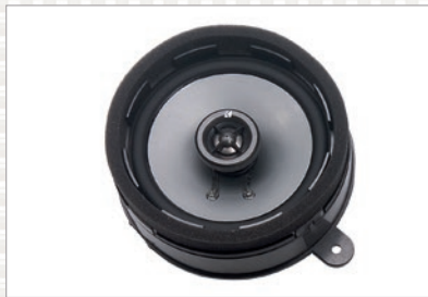
Kicker<sup>®</sup> Speaker Upgrade. Enhance the sound clarity of your vehicle's audio system with these high-efficiency, two-way speakers. They have quality-constructed injected-molded Poly cones with 20mm silk dome tweeters and a frequency response rated at 30hz to 22khz.

Excludes models equipped with Harman Kardon® audio.