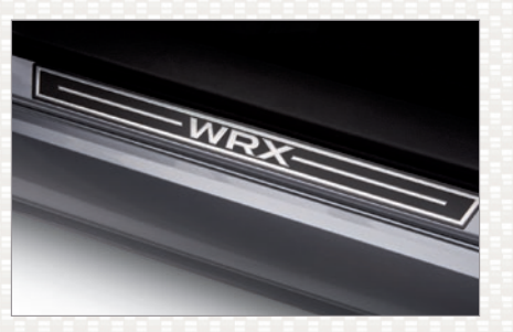
Side Sill Plates. Metallic-finished panels dress up the sill plates of the WRX. Set of four.