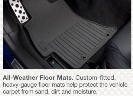
Not intended for use on top of Carpeted Floor Mats.

Excludes models equipped with Harman Kardon® audio.