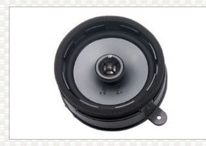
Kicker® Speaker Upgrade. Enhance the sound clarity of your vehicle's audio system with these high-efficiency, two-way speakers. They have quality-constructed injected-molded Poly cones with 20mm silk dome tweeters and a frequency response rated at 30hz to 22khz.

Excludes models equipped with Harman Kardon® audio.