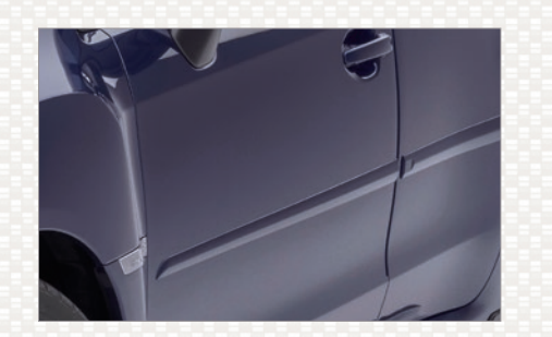
Body Side Molding. Attractive, color-matched moldings coordinate with the styling of the vehicle while helping to protect doors from unsightly dings.