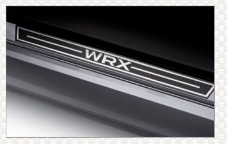
Side Sill Plates. Metallic-finished panels dress up the sill plates of the WRX. Set of four.