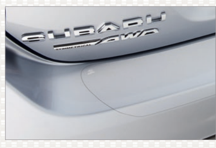
Rear Bumper Appliqué. Clear, scratch-resistant vinyl film helps to protect bumper upper surface and leading edge. Includes a discrete pearl-colored Subaru logo.