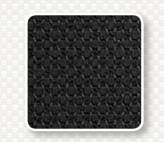
Carbon Black Checkered Cloth (CBCC)