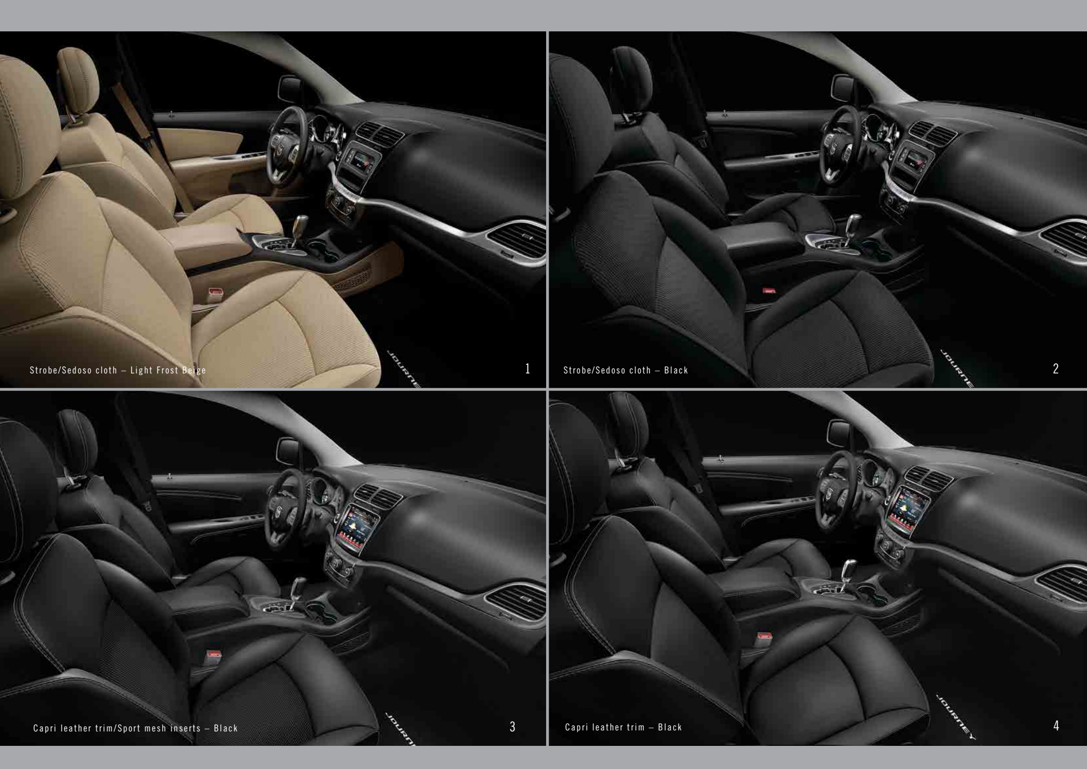
MORE INTERIOR CHOICES FEATURED ON THE NEXT PAGE.