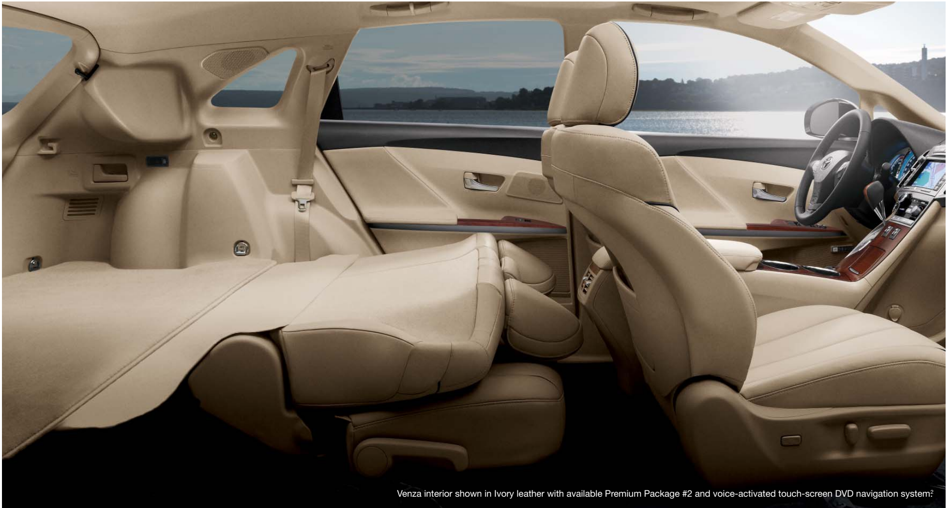
Venza interior shown in Ivory leather with available Premium Package #2 and voice-activated touch-screen DVD navigation system. 2

It's as flexible as your schedule demands. Running an errand that requires you to carry big, bulky items? No problem. With its rear seatbacks folded down, Venza has up to 70.1 cubic feet of cargo space. 1 And its rear seat features a 60/40 split, so you can carry a rear-seat passenger and still have expansive space left to hold the things you need to haul. Even with the rear seats reclined and all the seats occupied, there's still plenty of room left in the cargo area for everyone's luggage.