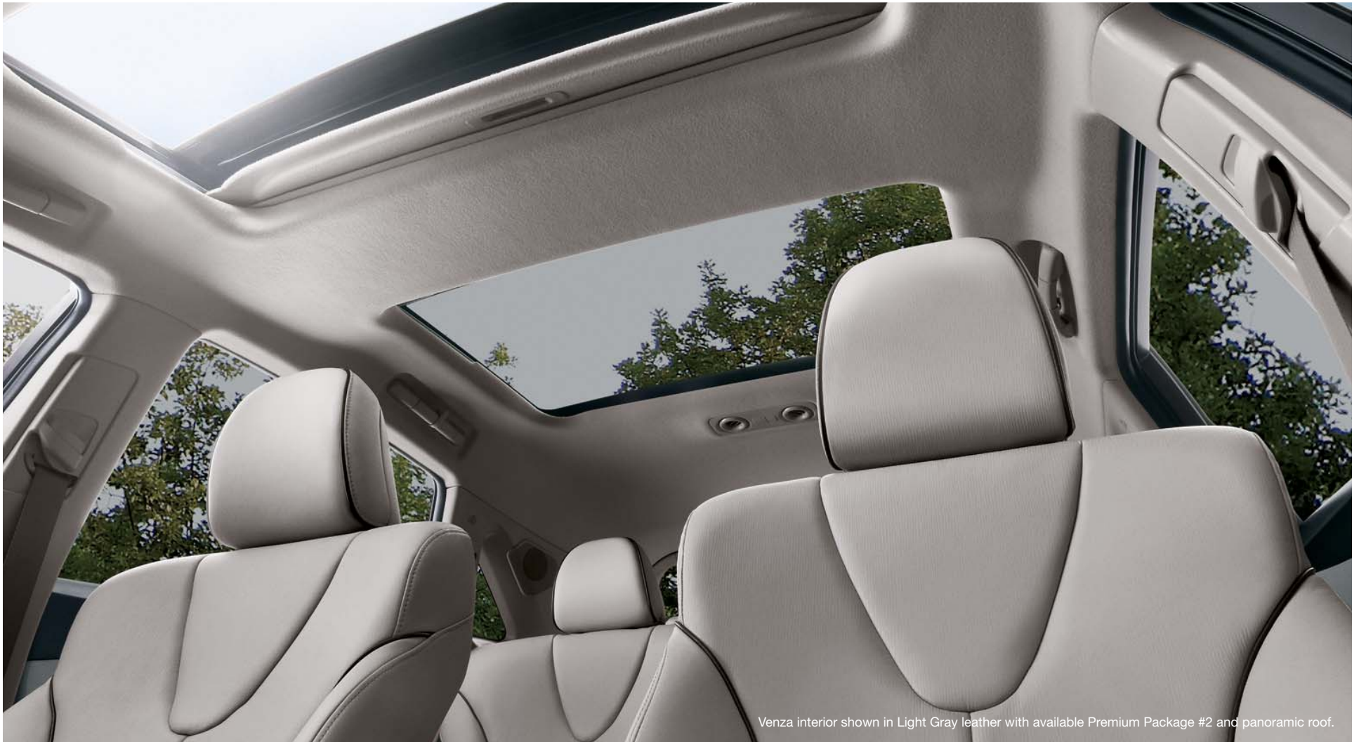
Venza interior shown in Light Gray leather with available Premium Package #2 and panoramic roof.

An available backup camera displays the area behind the vehicle visible to the camera on the available Multi-Information Display. Or, on vehicles equipped with the available voice-activated touch-screen DVD navigation system 2 ; it is displayed on the screen.