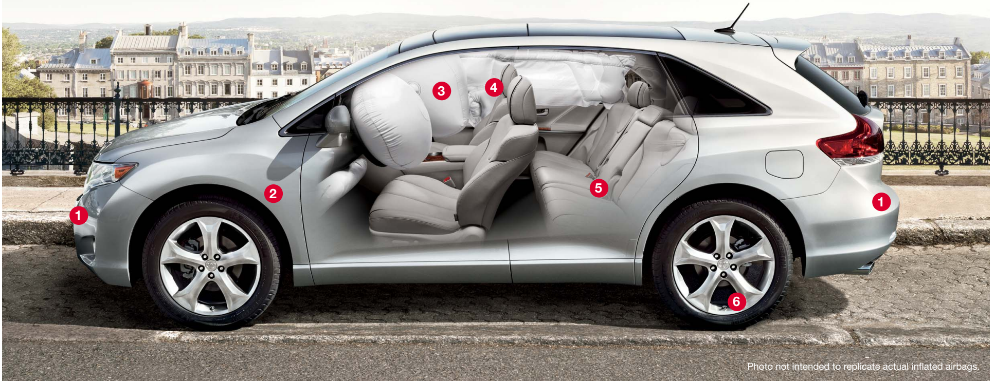
Photo not intended to replicate actual inflated airbags.

Front and rear energy-absorbing crumple zones and a collapsible steering column are designed to help dissipate impact forces in a collision and help protect occupants.