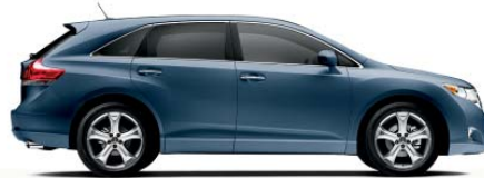
TROPICAL SEA METALLIC Ivory or Light Gray interior