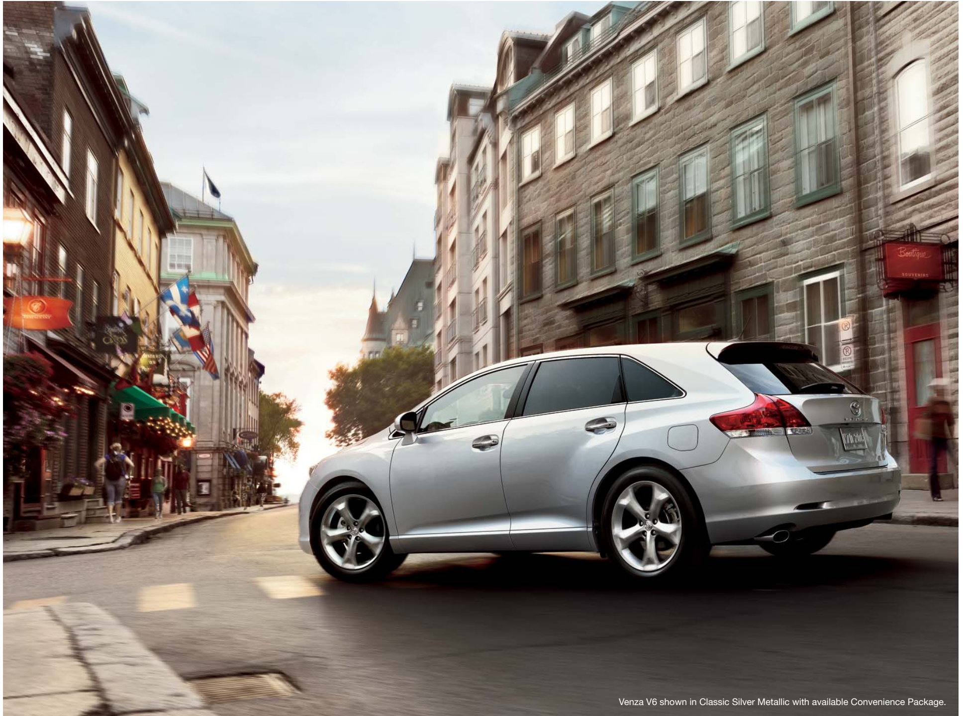
Venza V6 shown in Classic Silver Metallic with available Convenience Package.