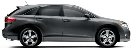
MAGNETIC GRAY METALLIC Ivory or Light Gray interior