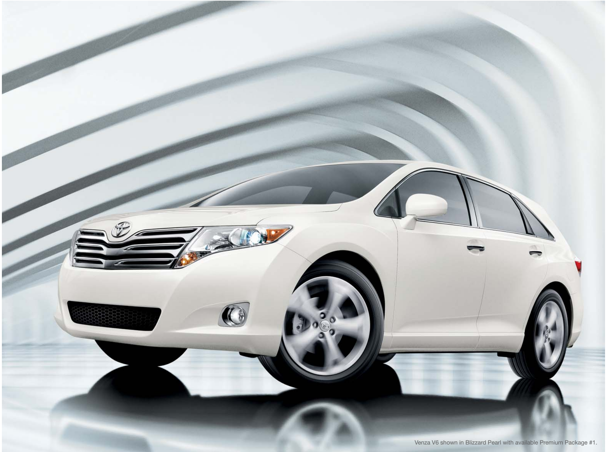
Venza V6 shown in Blizzard Pearl with available Premium Package #1.