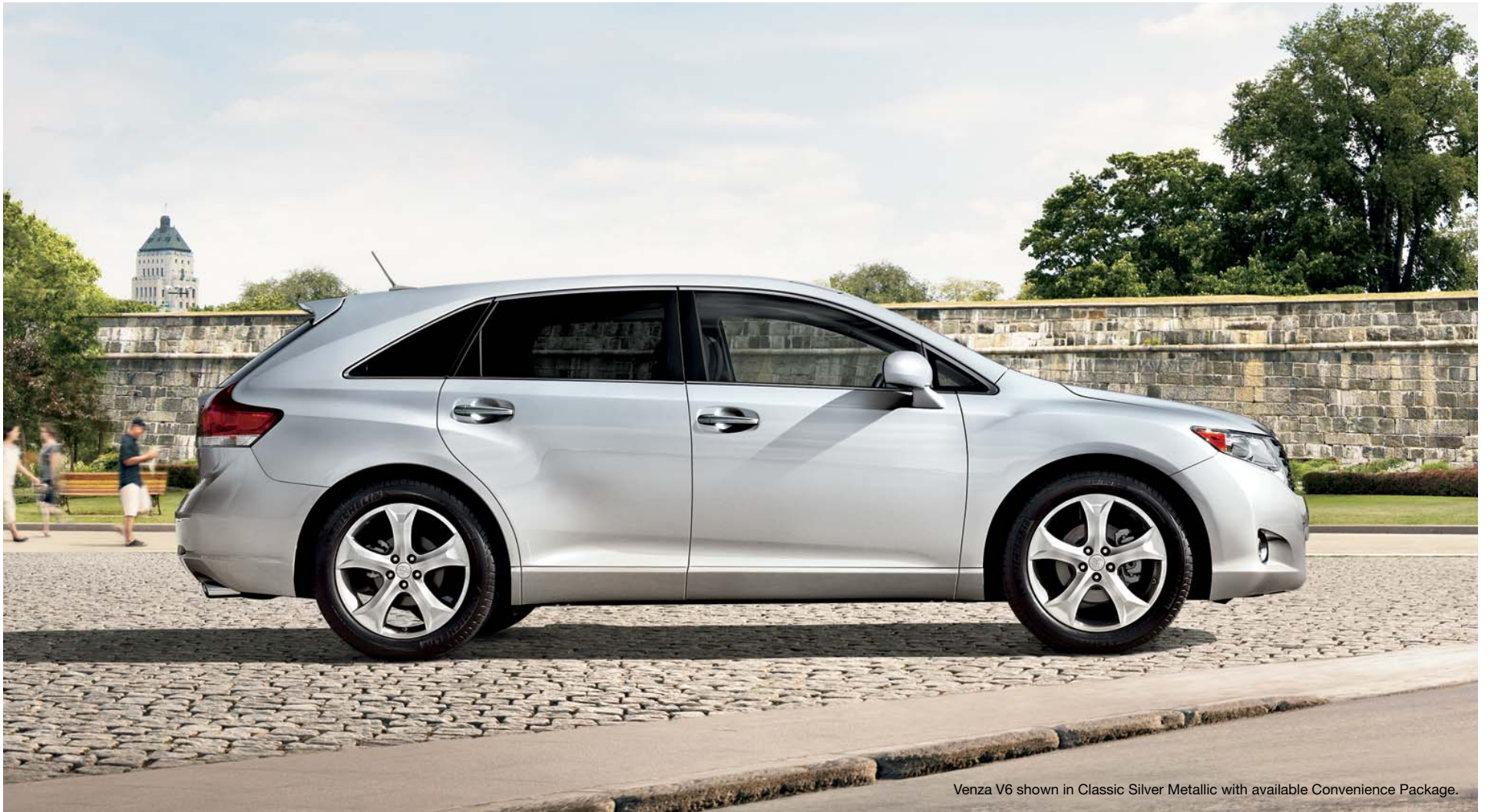
Venza V6 shown in Classic Silver Metallic with available Convenience Package.

5 It's a 5-passenger vehicle. But in Venza, quality matters just as much as quantity. So no matter where you're seated, you're made to feel as if the interior were tailored around you and your desire for sophisticated comfort. Outside, a bold, coupe-like design hints at the refinement that lies within.