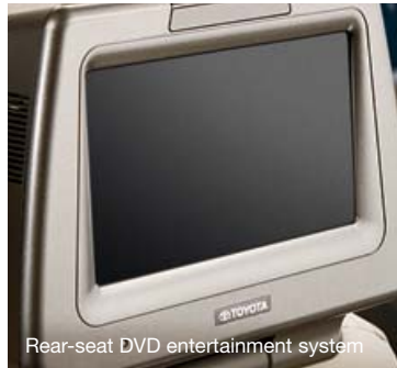
Rear-seat DVD entertainment system