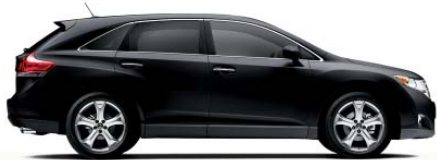
BLACK Ivory or Light Gray interior

With nine colors, it's not an easy choice. The finish of Venza is checked using laser-optic sensors that can detect minute deviations in the thickness of the paint. The result is a level of quality designed to keep Venza looking new for years to come.