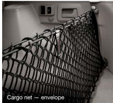
Cargo net — envelope

Add a personal touch to your Venza with Genuine Toyota accessories. Some accessories may not be available in all regions of the country. See your Toyota dealer for details.