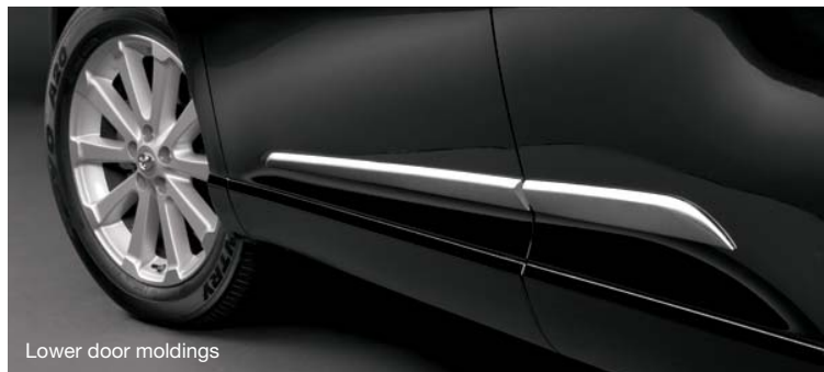
Lower door moldings