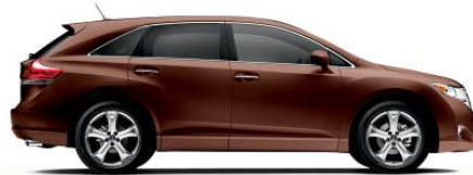
SUNSET BRONZE MICA Ivory interior