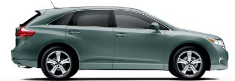
ALOE GREEN METALLIC Ivory or Light Gray interior