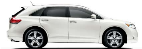
BLIZZARD PEARL 1 Ivory or Light Gray interior