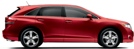
BARCELONA RED METALLIC Ivory or Light Gray interior