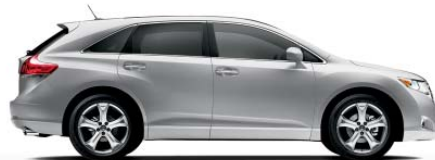
CLASSIC SILVER METALLIC Light Gray interior