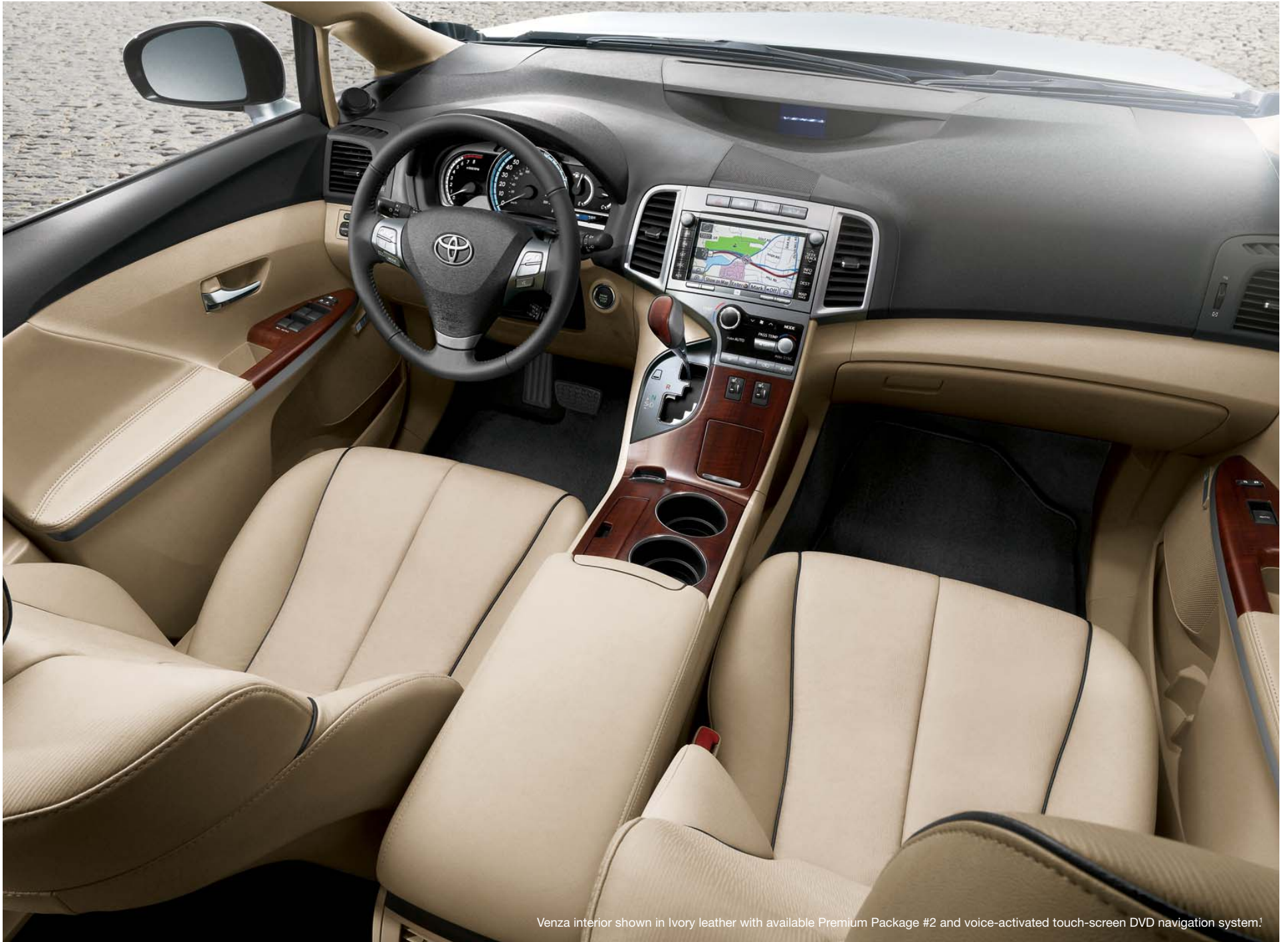
Venza interior shown in Ivory leather with available Premium Package #2 and voice-activated touch-screen DVD navigation system!