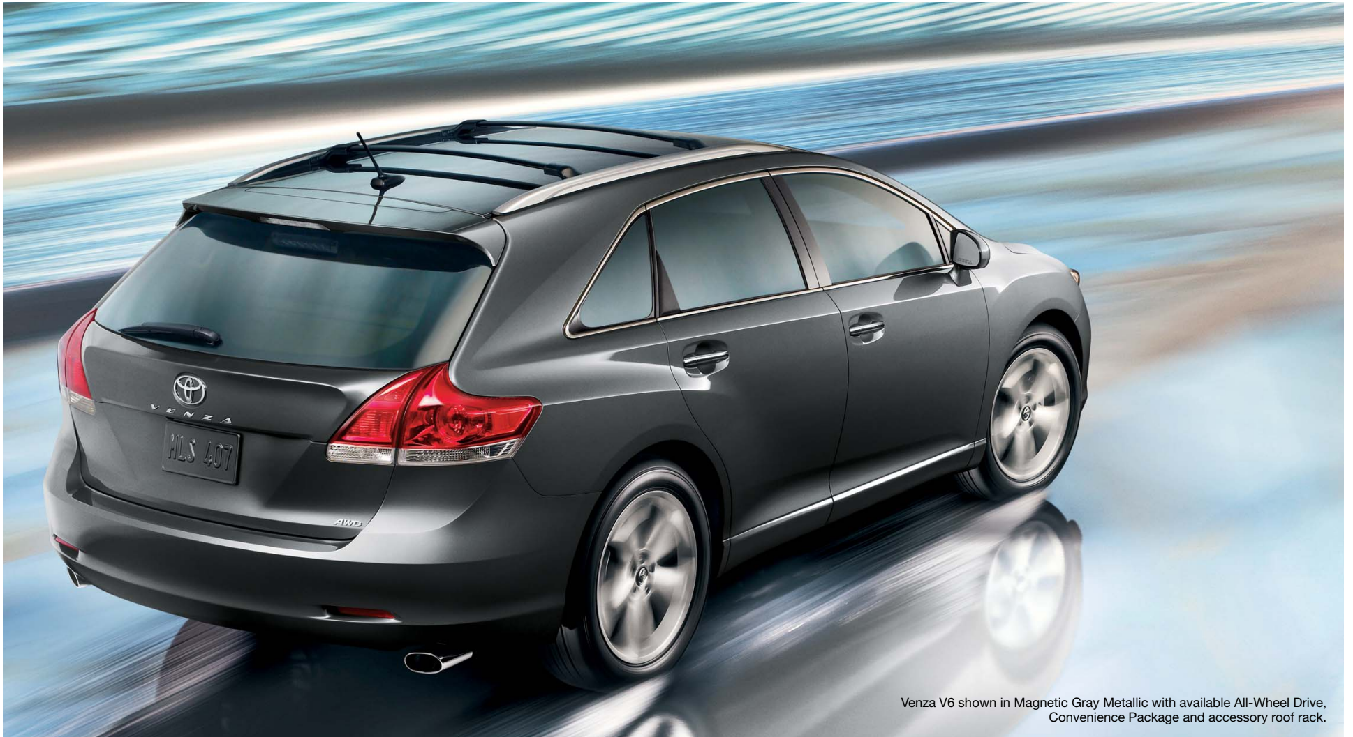
Venza V6 shown in Magnetic Gray Metallic with available All-Wheel Drive, Convenience Package and accessory roof rack.

Yes. The available system is called Active Torque Control AWD, and it actively controls each of the four wheels to optimize traction, distributing the engine's power to the appropriate wheels at just the right moment to help maintain secure traction on slippery surfaces.