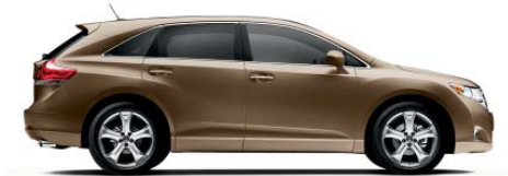
GOLDEN UMBER MICA Ivory interior