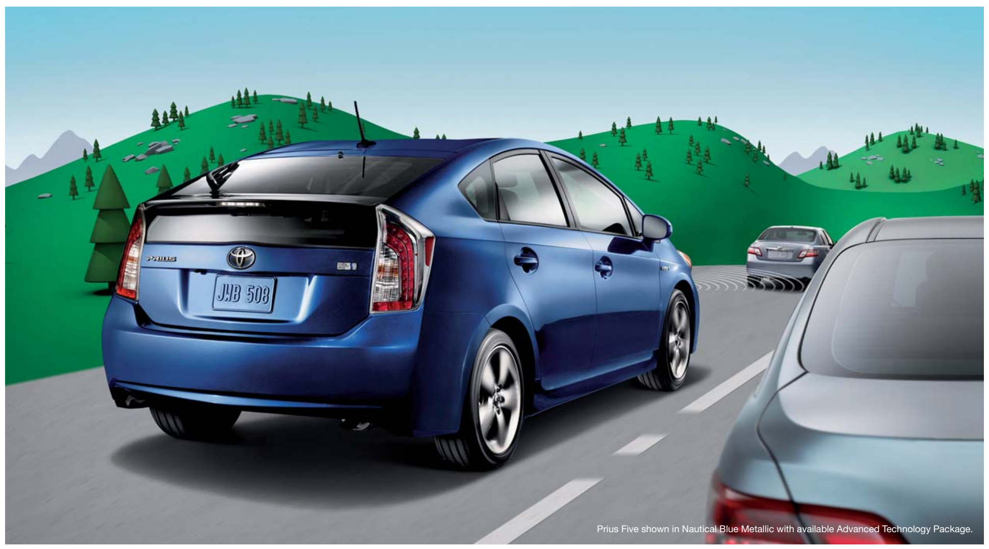
1. See footnote 7 in Disclosures section. 2. See footnote 8 in Disclosures section.