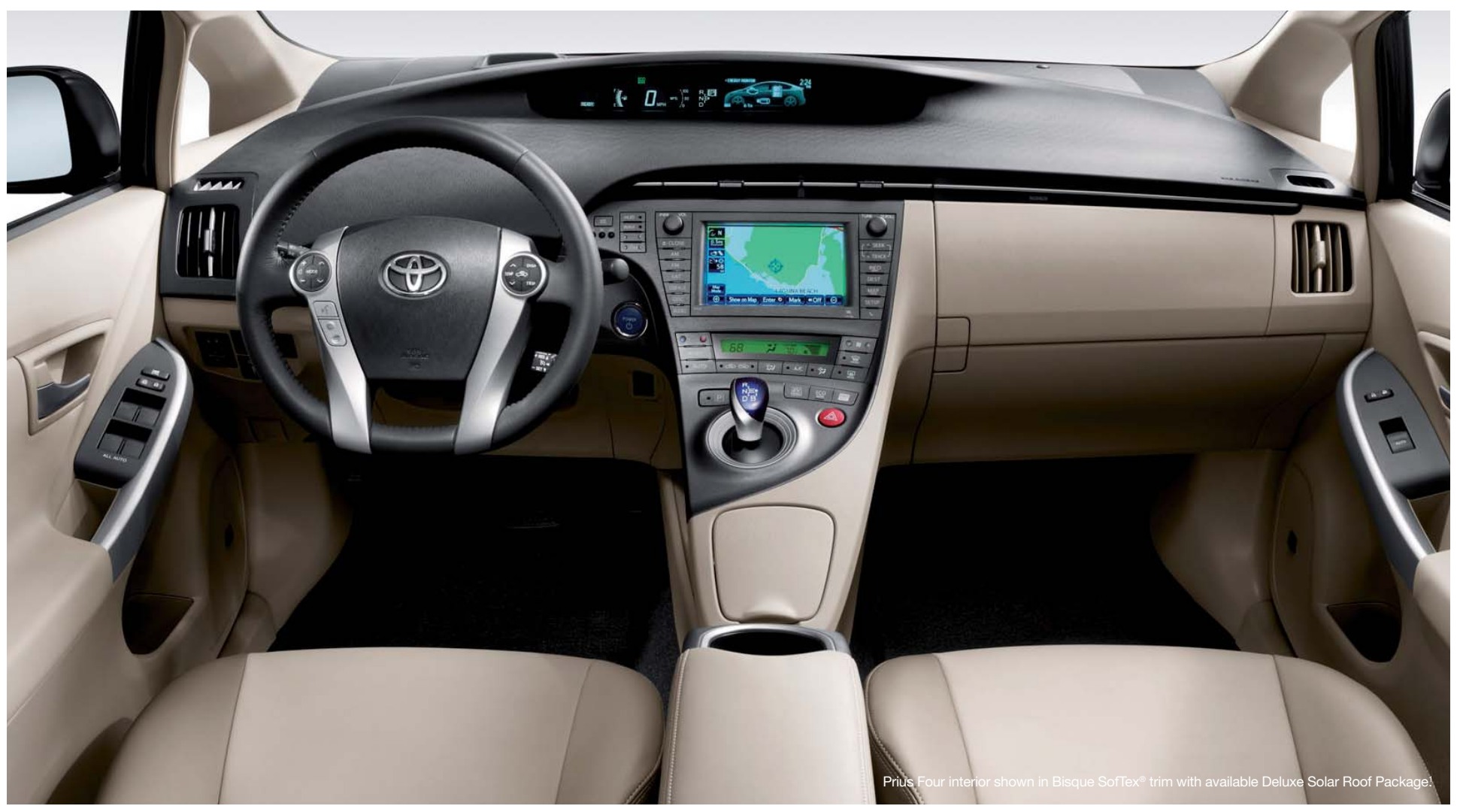
1. See footnote 2 in Disclosures section.