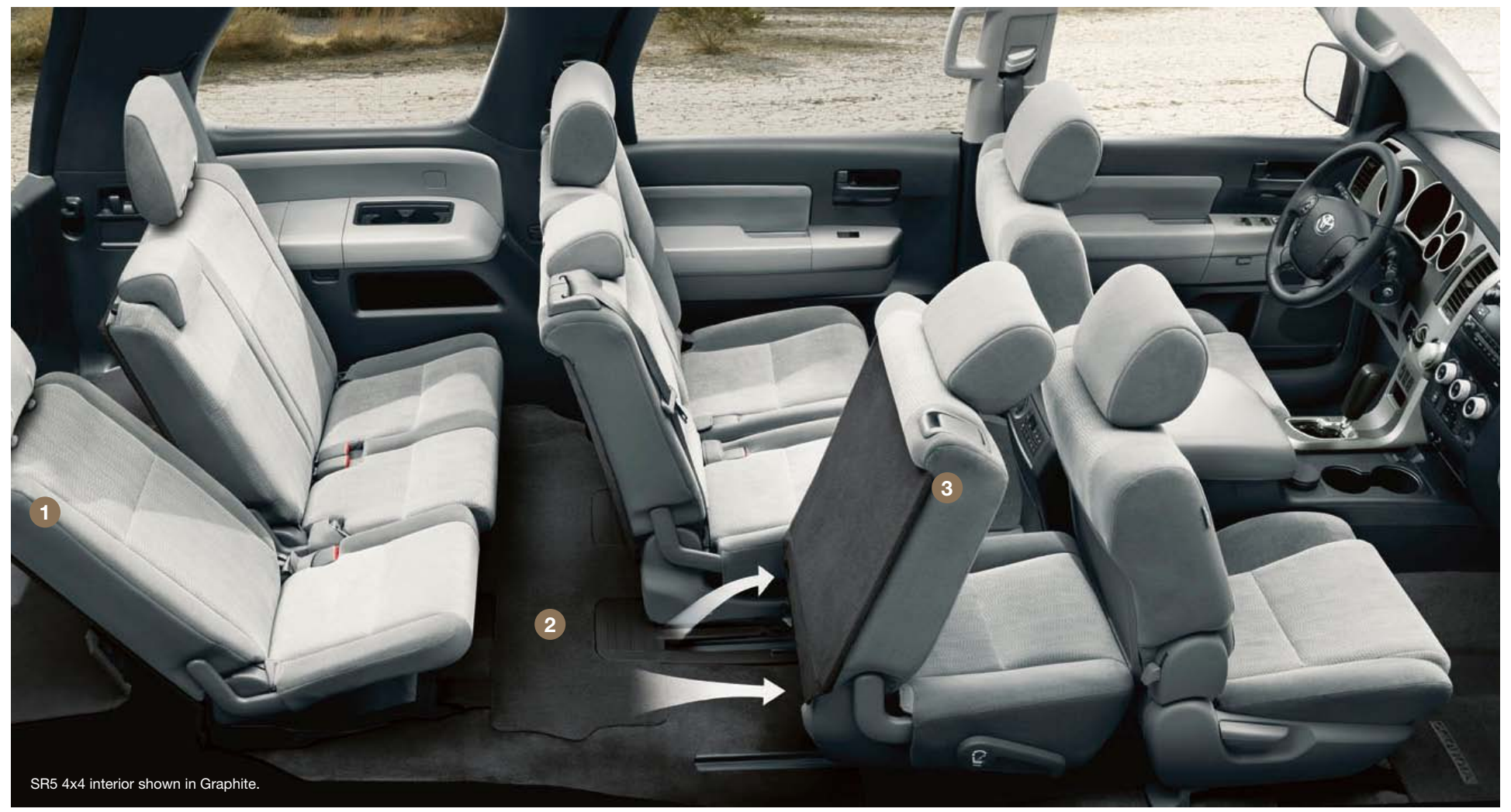
1. Standard on SR5 and Limited. Not available on Platinum.

With spacious seating for eight,<sup>1</sup> Sequoia has room for the whole family and then some. And what could be better? After all, adventures are best shared.