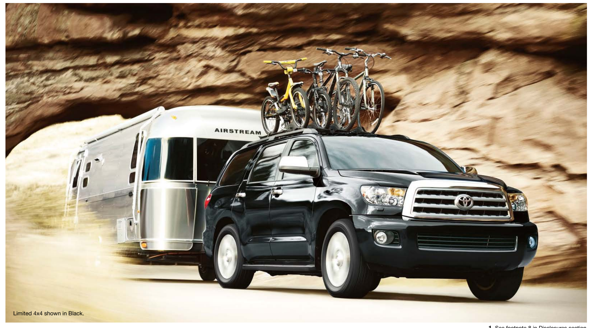
1. See footnote 8 in Disclosures section.

When you take your family into the sticks, you need a vehicle that's strong and reliable. Precisely what you get with Sequoia. It's forged on a fully boxed frame for strength and durability. It also boasts an available 381-hp 5.7L V8 with up to 7400 lb. of towing capacity. Plus, a TOW/HAUL mode that selects transmission shift points to optimize that power. So grab the gang and the gear. Where you're going, you won't need to fight for a space to put the picnic blanket.