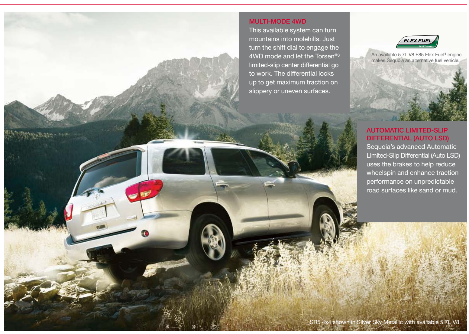
1. See footnote 27 in Disclosures section. 2. See footnote 28 in Disclosures section. 3. See footnote 5 in Disclosures section. 4. See footnote 4 in Disclosures section.

When towing, winds or load undulation can cause trailer sway. TSC is designed to apply brake pressure at individual wheels and manage engine torque to help the driver maintain control of the trailer.