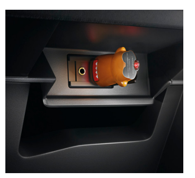
1. See footnote 6 in Disclosures section. 2. See footnote 7 in Disclosures section.

Yaris is available with this sporty leather-trimmed shift lever. You'll also find a standard auxiliary audio jack and a USB port¹ with iPod®² connectivity, so you can plug in your iPod® or other compatible digital music player and enjoy MP3/WMA playback capability.