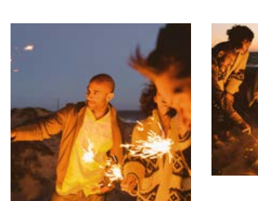
Great photos. Great stories. So much to share, but let's celebrate the last rays of the sun together first.