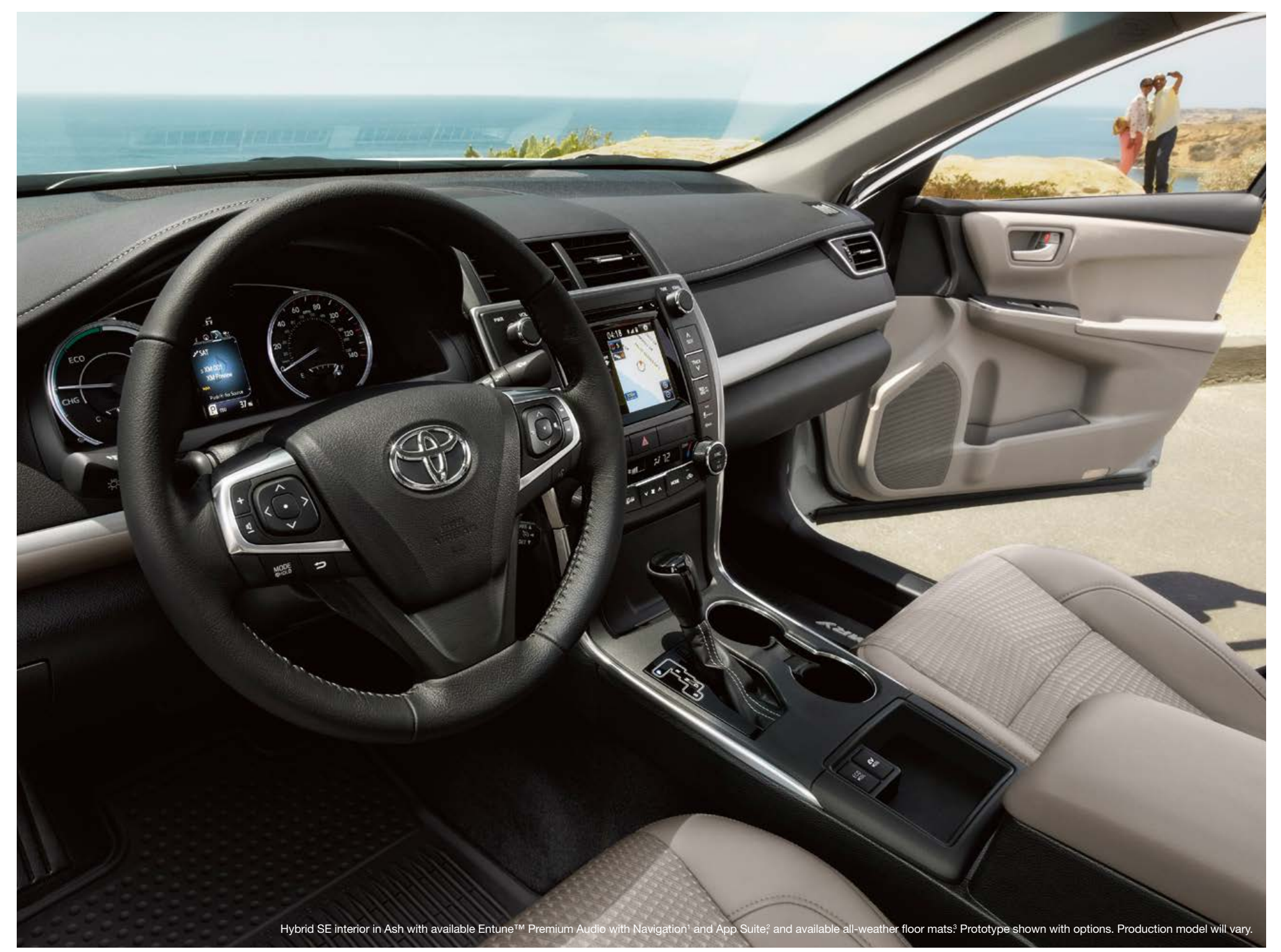
1. See footnote 12 in Disclosures section. 2. See footnote 13 in Disclosures section. 3. See footnote 41 in Disclosures section.