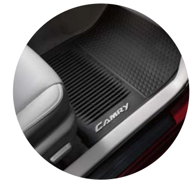
All-weather floor mats41