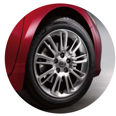
17-in. liquid-metal-finish wheels

Rear bumper appliqué Rear spoiler Remote Engine Starter<sup>44</sup> Vehicle Intrusion Protection (VIP) Security System