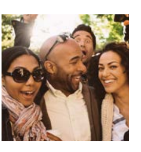
Let's get some friends together, drive from the mountains to the beach, and chase the sunset.