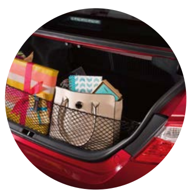
Hideaway cargo net<sup>36</sup>