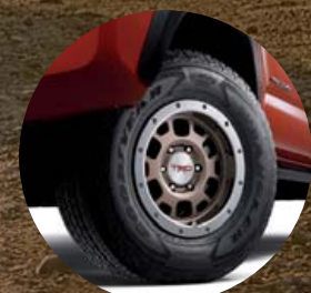
TRD 16-in. off-road beadlock-style wheels