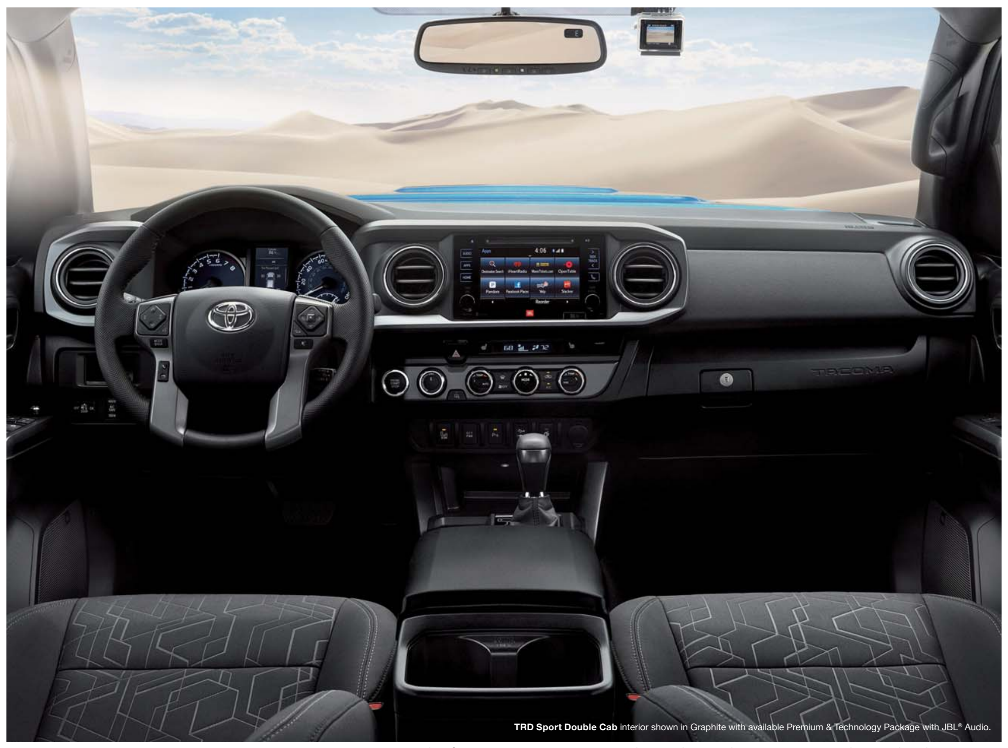
GoPro® mount on the windshield is to be used with GoPro HERO cameras. GoPro® camera not included. GoPro, HERO, the GoPro logo, and the GoPro Be a Hero logo are trademarks or registered trademarks of GoPro, Inc. Prototype shown with options. Production model may vary.