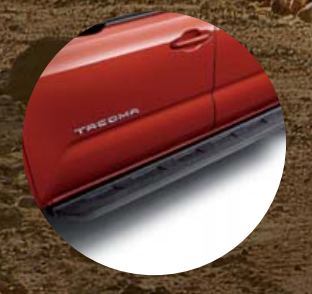
Cast-aluminum running boards