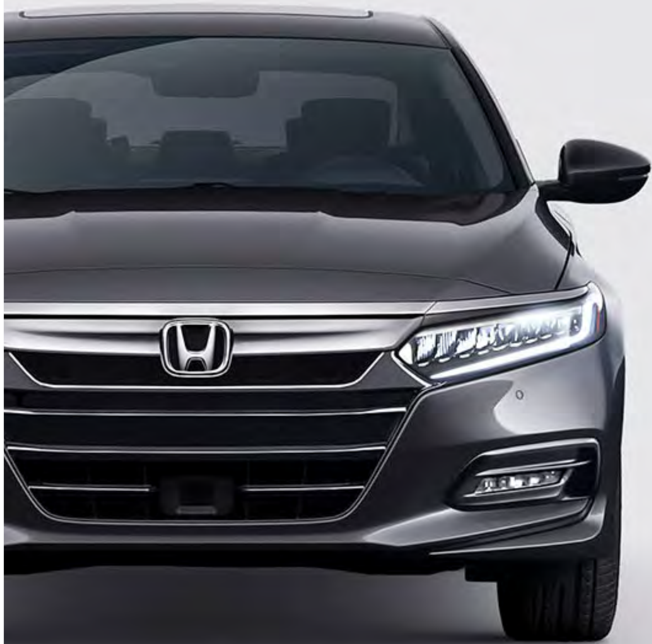
Accord Touring shown in Modern Steel Metallic.