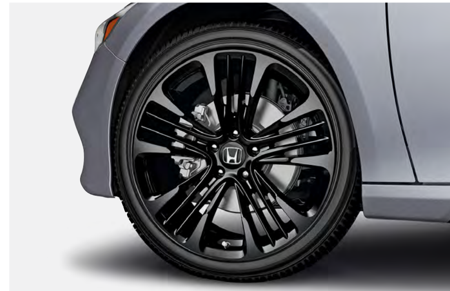
19-Inch Glint Black Alloy Wheels