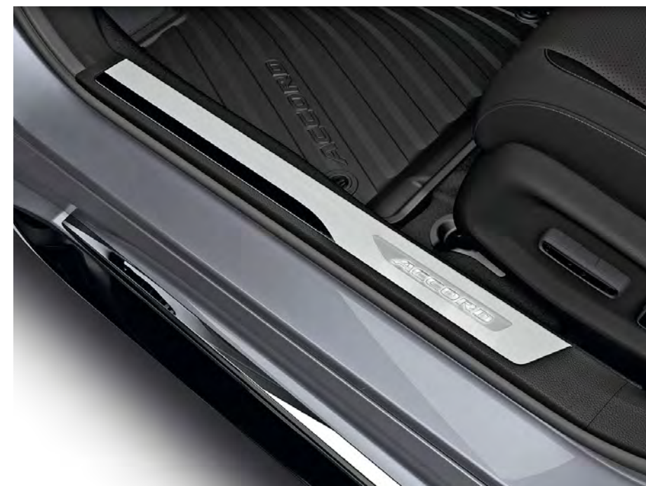
Door Sill Trim