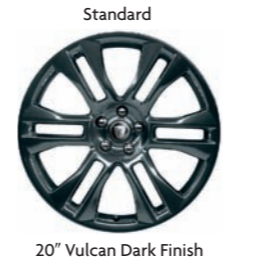
Standard 20" Vulcan Dark Finish

5.0L V8 SUPERCHARGED COUPE MSRP STARTING AT $132,000 †