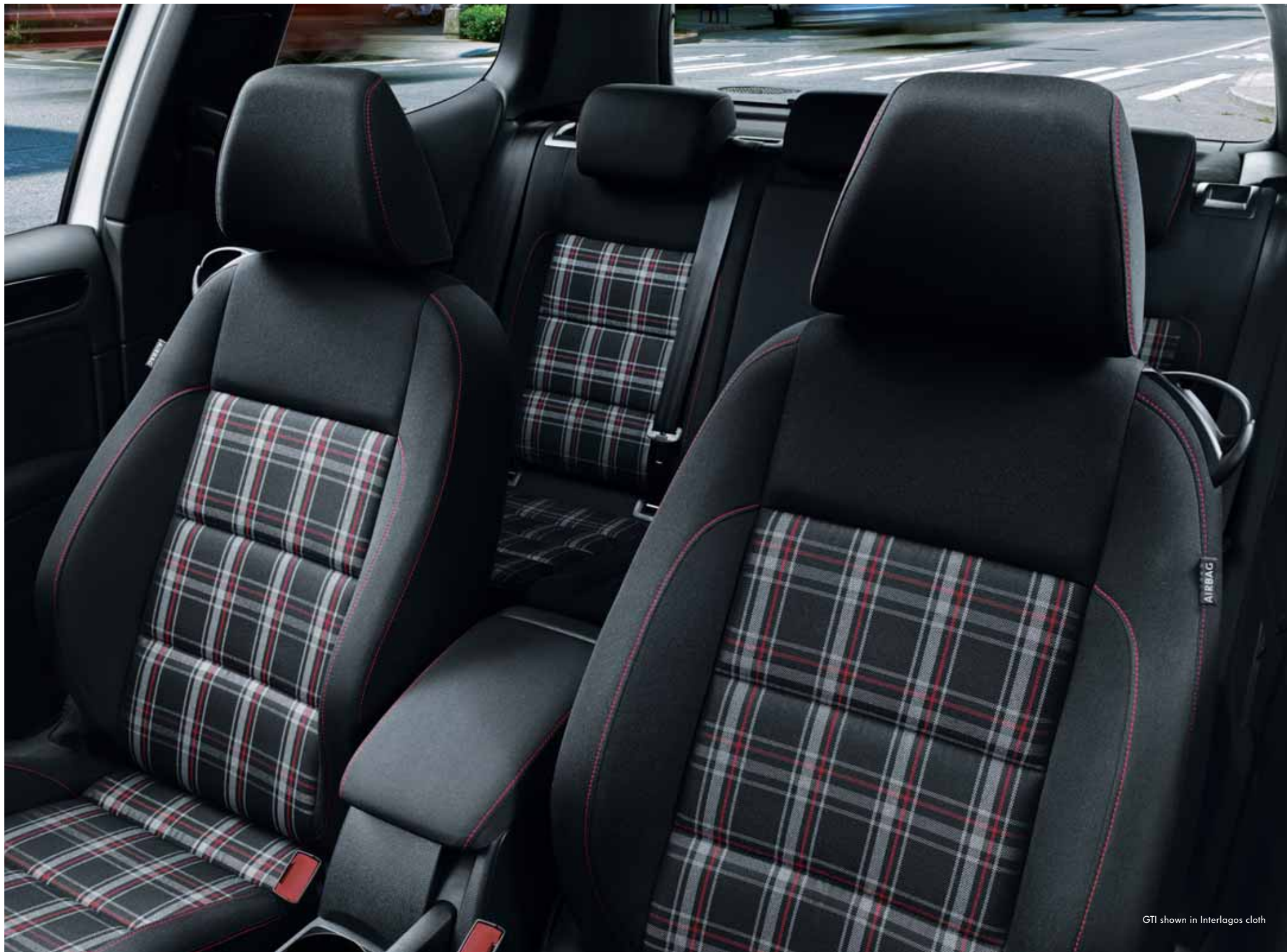
GTI shown in Interlagos cloth