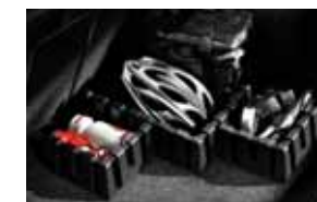
Heavy Duty Trunk Liner with Cargo Organizer Blocks