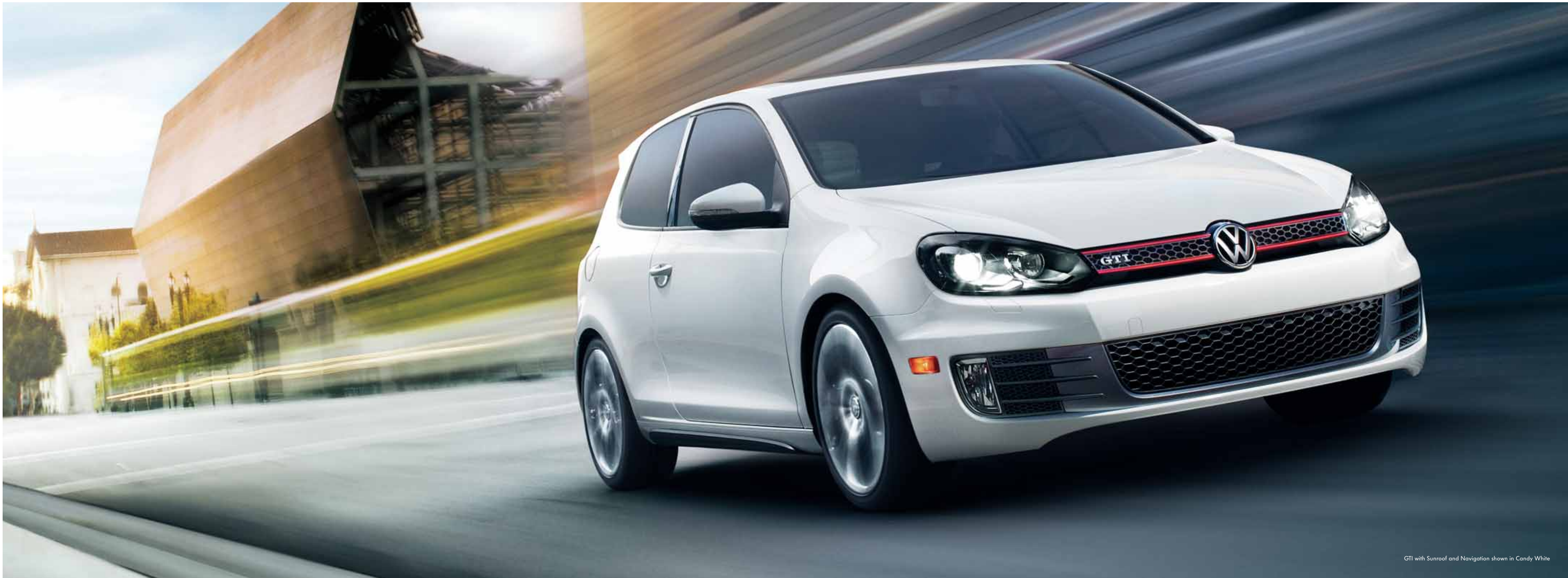
GTI with Sunroof and Navigation shown in Candy White