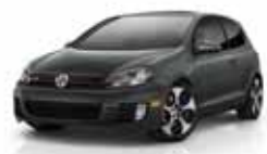
Carbon Steel Gray Metallic