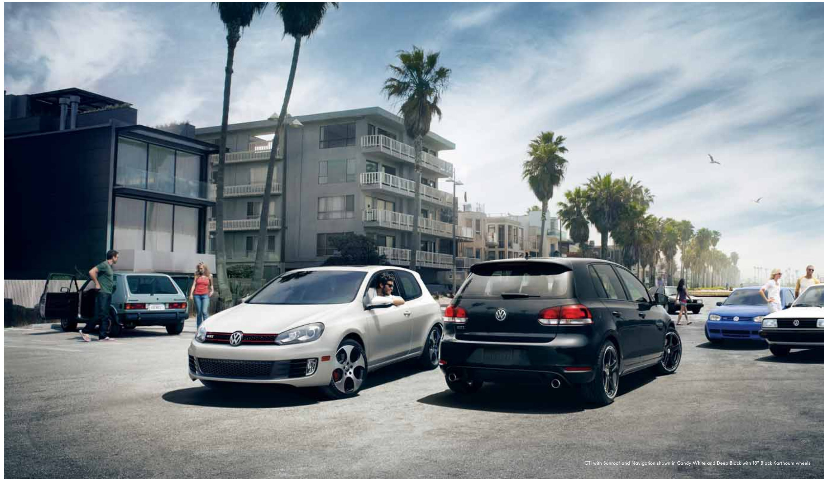
GTI with Sunroof and Navigation shown in Candy White and Deep Black with 18" Black Karthoum wheels

AUTOMOBILE Magazine named it "Automobile of the Year" for a record-breaking second time in history. CarandDriver.com called the GTI "a true icon among compact hatchbacks."* U.S. News and World Report ranked it #1 in upscale small cars.** It's tough outdoing yourself year after year. But when you're making an iconic, #1 ranked Automobile of the Year, it's worth all the effort. Because when the accolades start pouring in and our fan base continues to grow, it feels pretty darn good. So even if the awards went away and all we had to celebrate was the incredible popularity of the GTI, we wouldn't mind. After all, it's really the opinions of our fans that matter most. The rest is just icing on a really sporty, extra shiny, turbocharged cake.