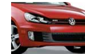
Front Lip Spoiler