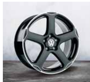
18" Black Karthoum