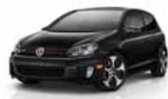
Deep Black Metallic