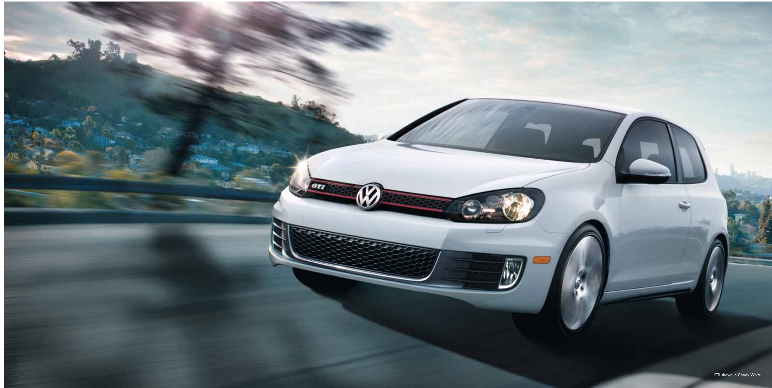
GTI shown in Candy White

*Government star ratings are part of the National Highway Traffic Safety Administration's (NHTSA) New Car Assessment Program ( www.safercar.gov ). 2010 4-door model tested with standard side airbags. **Airbags are supplemental restraints only and will not deploy under all crash circumstances. Always use safety belts and seat children only in the rear, using restraint systems appropriate for their size and age.