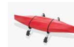
Base Carrier Bars with Kayak Holder