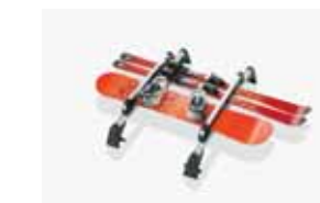
Base Carrier Bars with Ski and Snowboard Rack

*Please refer to the disclaimer on the back cover for important information about performance tires. **Airbags are supplemental restraints only and will not deploy under all crash scenarios. Always use safety belts and seat children only in the rear, using restraint systems appropriate for their size and age. †Roadside Assistance provided by Cross Country Automotive Services.