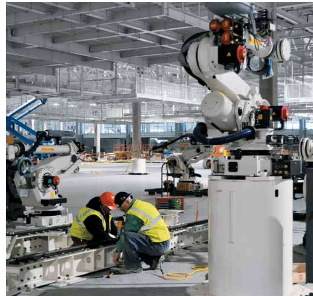
To help us ensure the highest-quality production for our cars, our employees help program each state-of-the-art robot to perform its specific task so the robots can assist during the production and assembly process.

In order to enable our employees to meet our high quality standards, we partnered with the state of Tennessee to build the Volkswagen Academy. We then hired the best team of trainers to ensure that we have the most talented group of plant technicians anywhere.