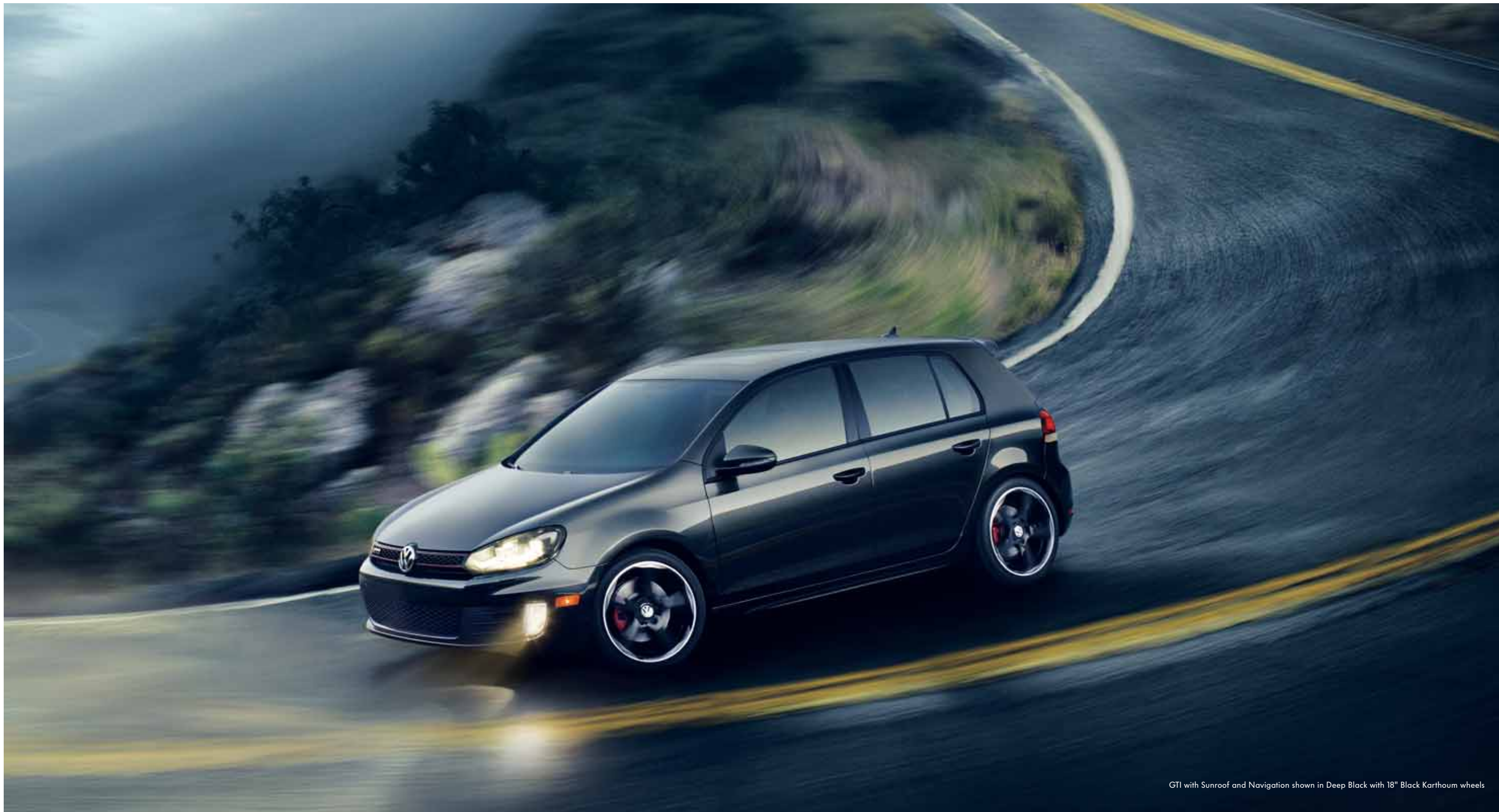
GTI with Sunroof and Navigation shown in Deep Black with 18" Black Karthoum wheels