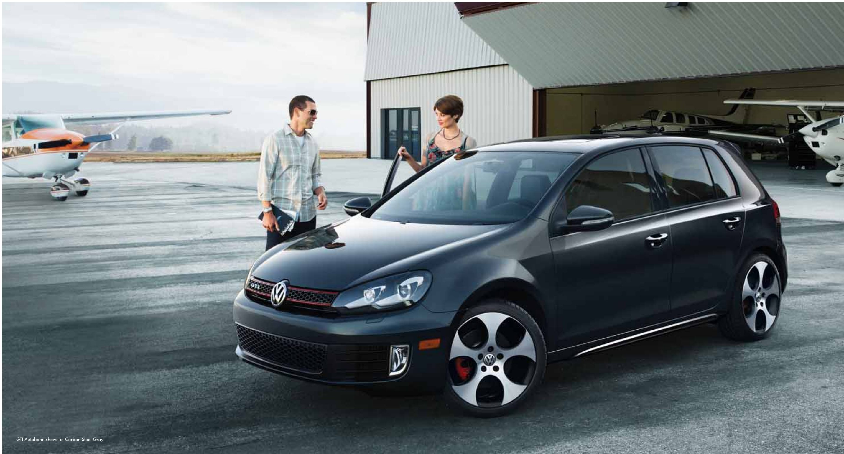
GTI Autobahn shown in Carbon Steel Gray