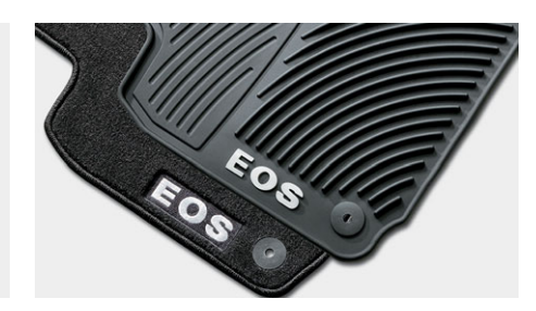
Monster Mats® and MojoMats®