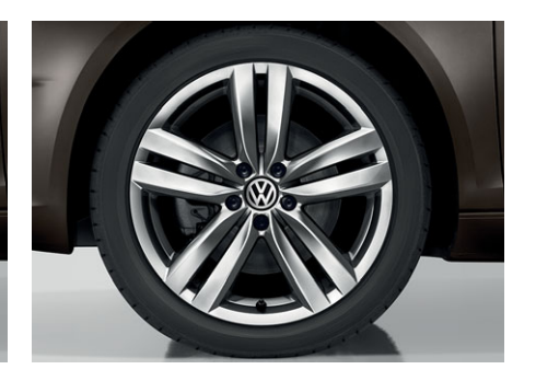
Komfort 17" Michigan