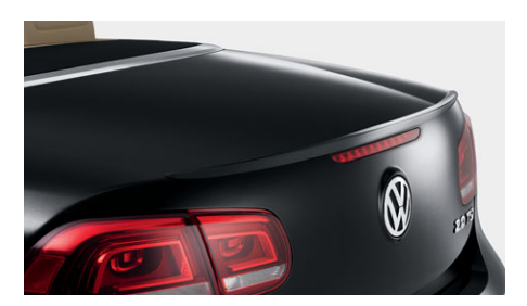
Rear Lip Spoiler

To see more accessories for you and your VW, visit www.parts.vw.com or see your Consultant.