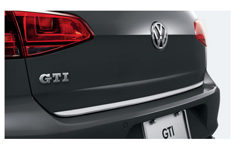
Chrome Look Rear Accent Strip