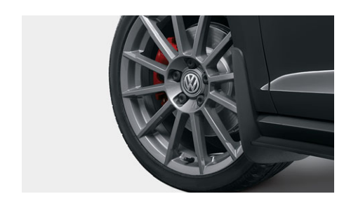
18" Rotary Wheels and Splash Guards

To see more accessories for you and your VW, visit www.parts.vw.com or see your Consultant.