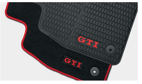
Monster Mats® and MojoMats®