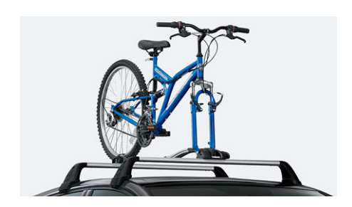
Base Carrier Bars and Fork Mount Bike Holder