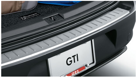
Rear Bumper Protection Plate