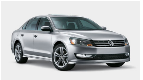
Body Styling Kit