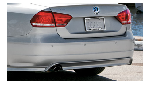
Park Distance Control