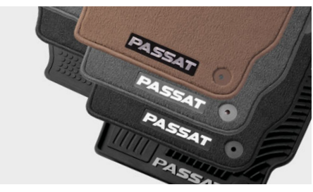
MojoMats® and Monster Mats®