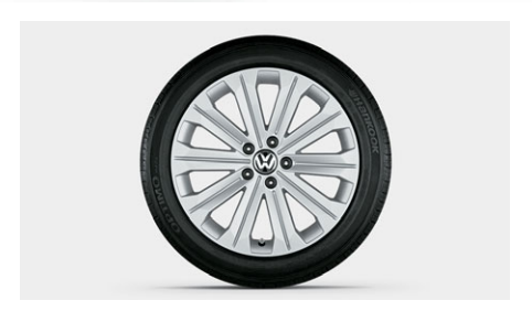
18" Spokane Wheel

To see more accessories for your VW, visit www.parts.vw.com or see your Consultant.