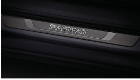
Illuminated Door Sill Protection Trim