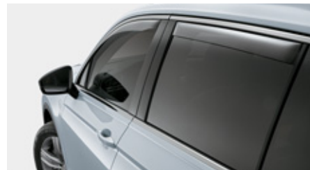
Side Window Deflectors — Tinted