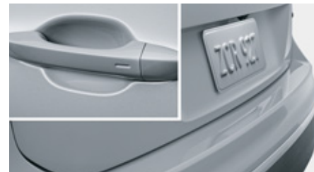
Rear Bumper and Door Cup Paint Protection Film