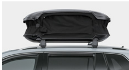
Base Carrier Bars and URBAN LOADER ®***