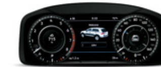
Driver profile selection