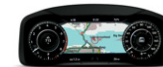
Wide map navigation view

The Tiguan can store up to four driver profiles, remembering your personalization preferences for a wide variety of different settings and systems.