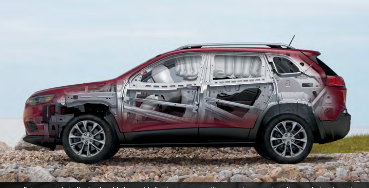
Enhancements to the front end help provide front passengers with reassuring security in the event of an impact.

Forward Collision Warning - Plus with Active Braking<sup>5</sup> detects fast approaches to objects and vehicles, and provides alerts and brake assistance if the driver does not react in time. Available.