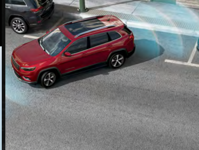
Parallel and Perpendicular Park Assist<sup>4</sup> actively guides steering to help you ease into parking spots. Available.