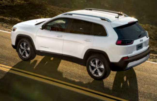
The new liftgate is crafted from strong, lightweight materials for improved efficiency.