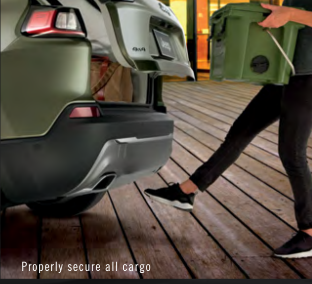
New! When your hands are full, easily open the rear liftgate with a swipe of your foot. A convenient available feature.