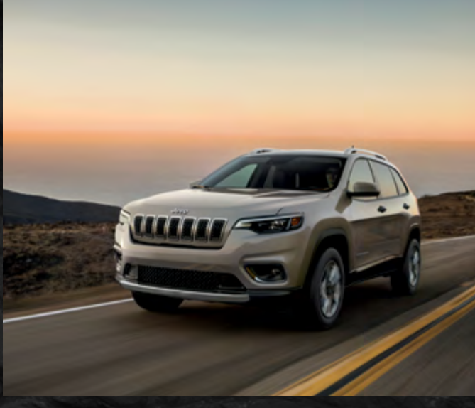
Premium performance is yours, with the available 2.0L Turbo I-4 engine. At 270 hp and 295 lb-ft of torque, it has the power of much larger engines, yet delivers incredible efficiencies.