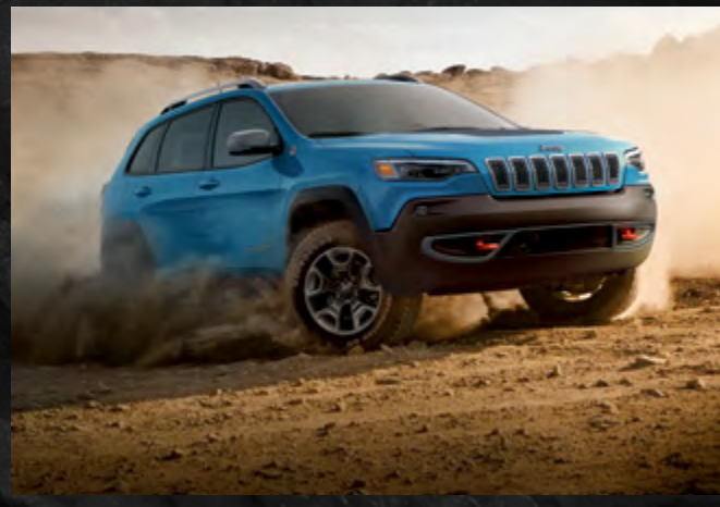
Cherokee Trailhawk arrives with Trail Rated® Jeep<sub>®</sub> Active Drive Lock 4WD, with the improved traction capability to dig in deep, thanks to its electronic rear axle lock.