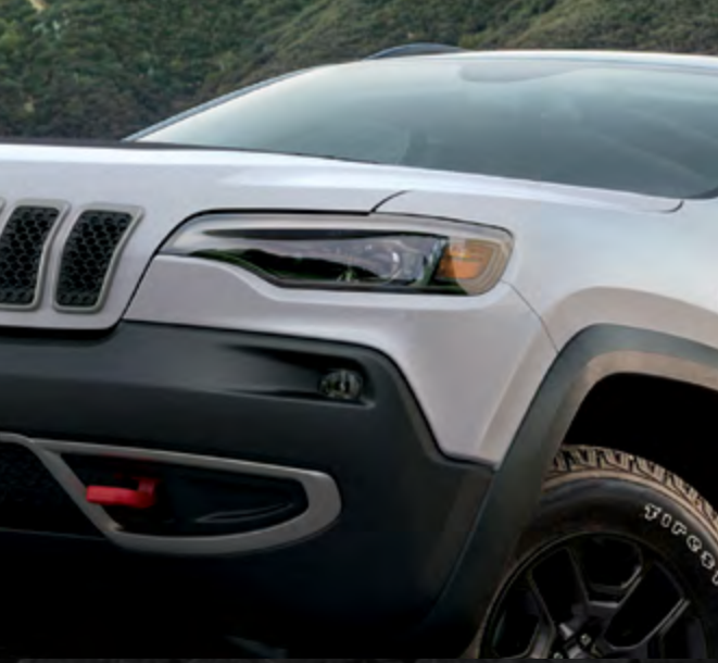
The 2019 Cherokee features a new front end and LED headlamps that shine bright and far, for safe driving day and night.