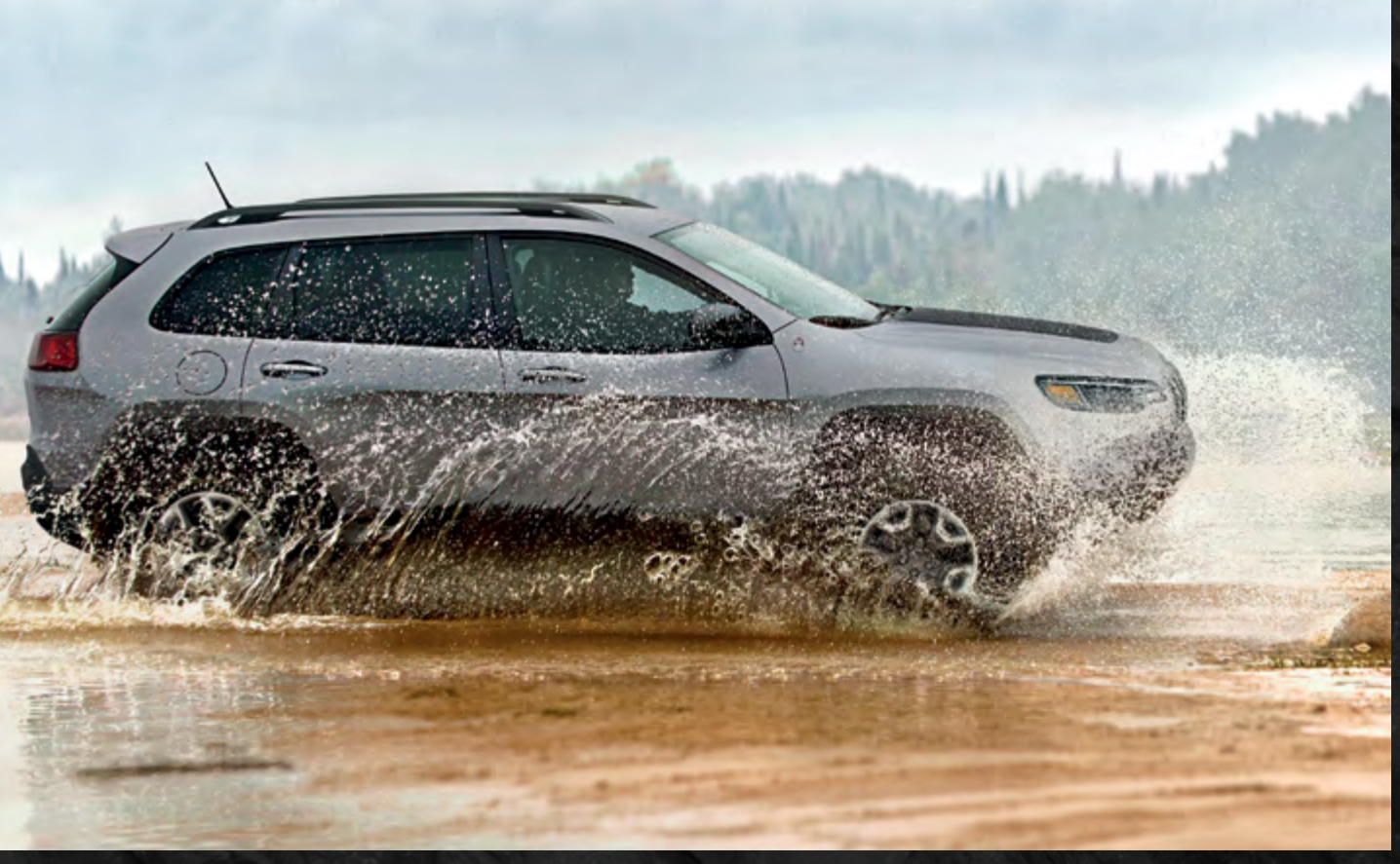
Every Cherokee 4x4 is equipped with the Selec-Terrain® Traction Management System, including the exclusive Rock Mode on Trailhawk.® Match your capability to your adventurous nature and the road conditions you meet along the way.