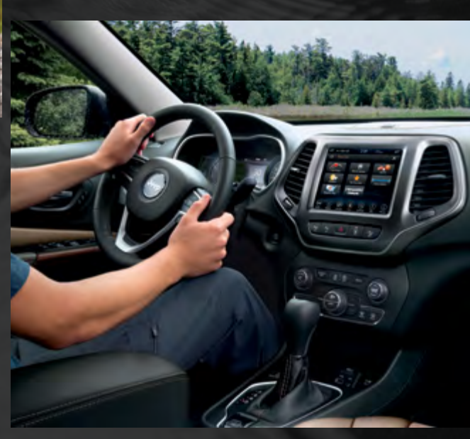
Advanced technology aids safe travel, including available 4G Wi-Fi<sup>3</sup>