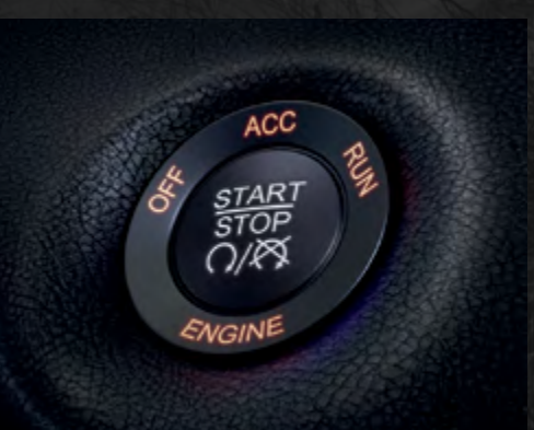
The available Keyless Enter 'n Go™ means no more fumbling for keys to get going.