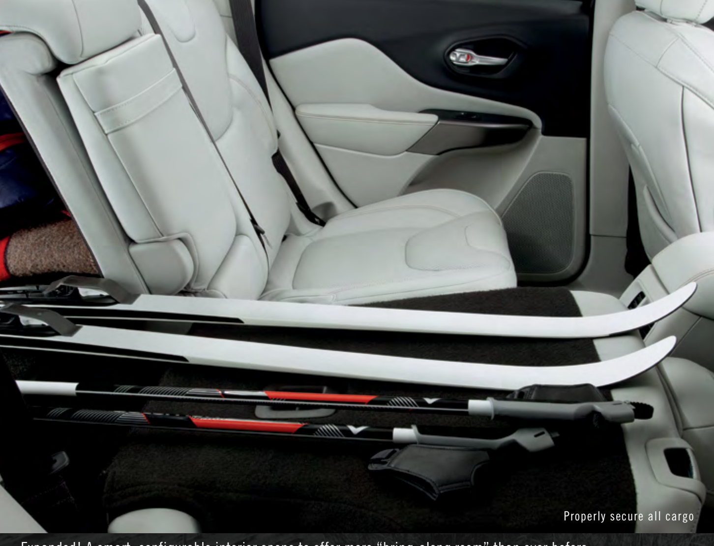
Expanded! A smart, configurable interior opens to offer more "bring-along room" than ever before.