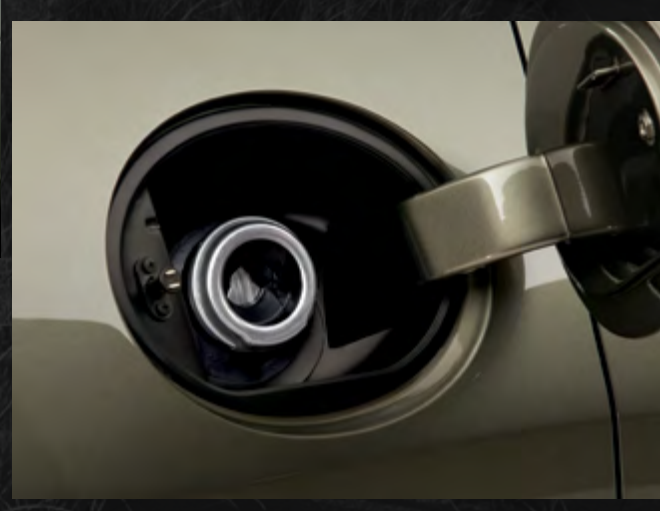
New! The convenient capless fuel-filler door helps keep your hands clean.