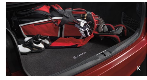
For a complete list of Genuine Lexus Accessories, visit lexus.com/GSF/accessories