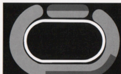
Bristol Motor Speedway .533-mile oval