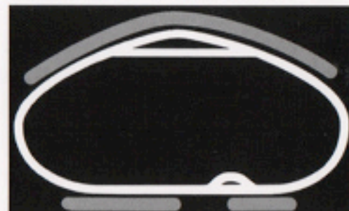
Daytona International Speedway 2.5-mile tri-oval