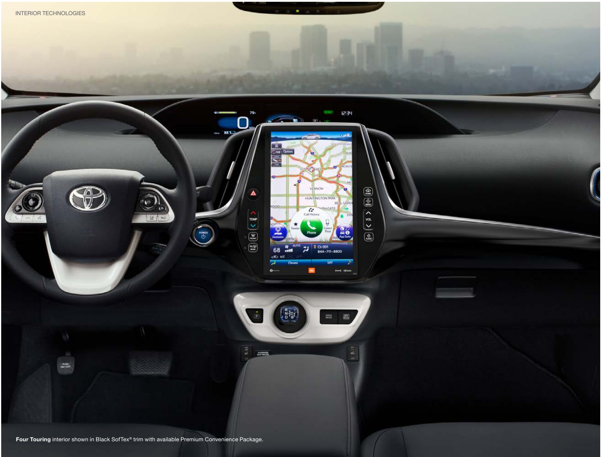
Four Touring interior shown in Black SofTex® trim with available Premium Convenience Package.