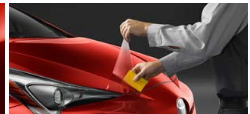
Paint protection film 49

See numbered footnotes in Disclosures section.