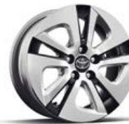
TWO, TWO Eco, THREE and FOUR 15-in. 5-spoke alloy wheels with two-tone wheel covers