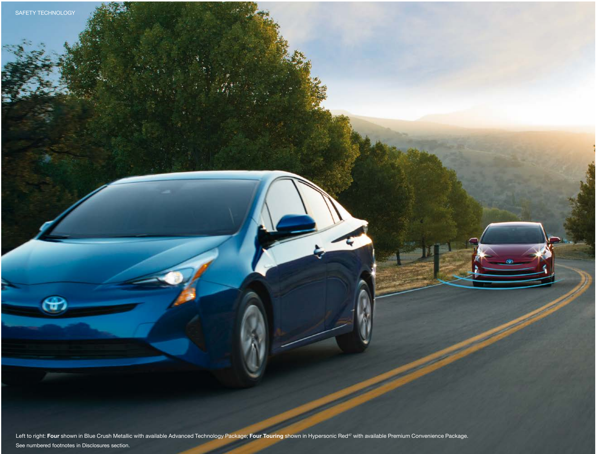
Left to right: Four shown in Blue Crush Metallic with available Advanced Technology Package; Four Touring shown in Hypersonic Red 47 with available Premium Convenience Package. See numbered footnotes in Disclosures section.