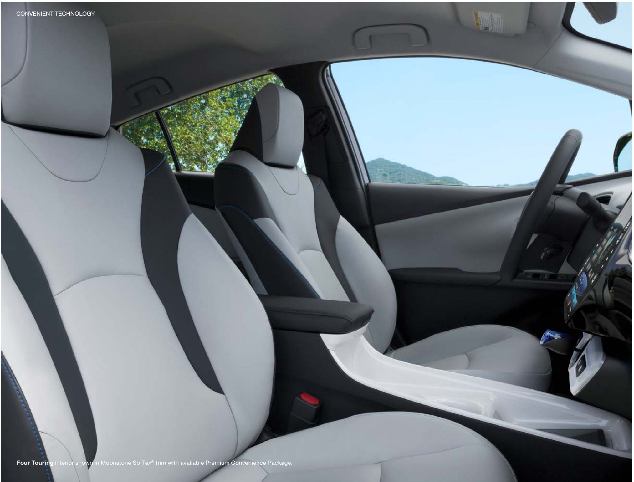
Four Touring interior shown in Moonstone SofTex® trim with available Premium Convenience Package.