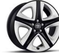
THREE Touring and FOUR Touring 17-in. 5-spoke alloy wheels