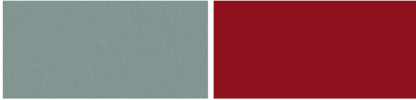
Sea Glass Pearl