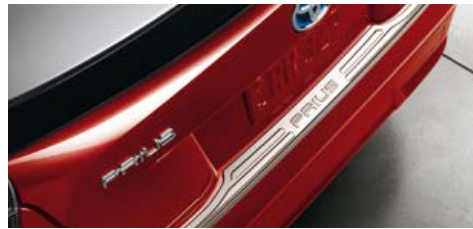
Rear bumper protector