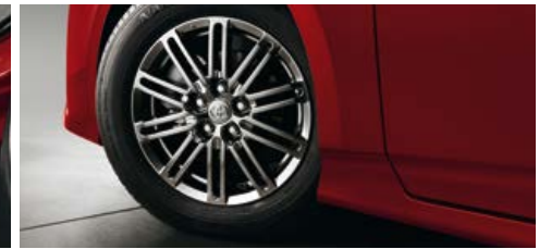
15-in. "Hyper Black" 10-spoke alloy wheels