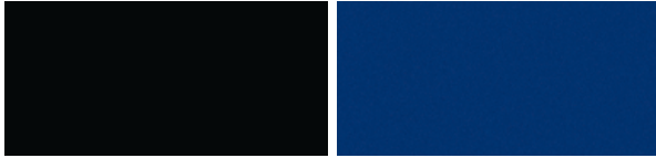
Midnight Black Metallic