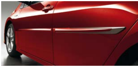
Body side moldings

Rear bumper appliqué Rear bumper protector Universal tablet holder 50