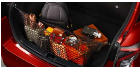
Cargo net — envelope 44