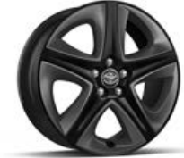
THREE and FOUR Touring 17-in. 5-spoke alloy wheels with gunmetal wheel inserts (available with Appearance Package)