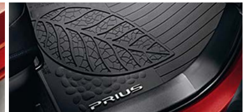
All-weather floor liners 48