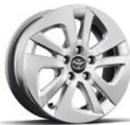
ONE 15-in. 5-spoke alloy wheels with full wheel covers