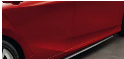
Aero side splitters