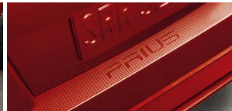
Rear bumper appliqué