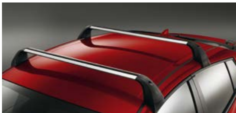
Cargo cross bars