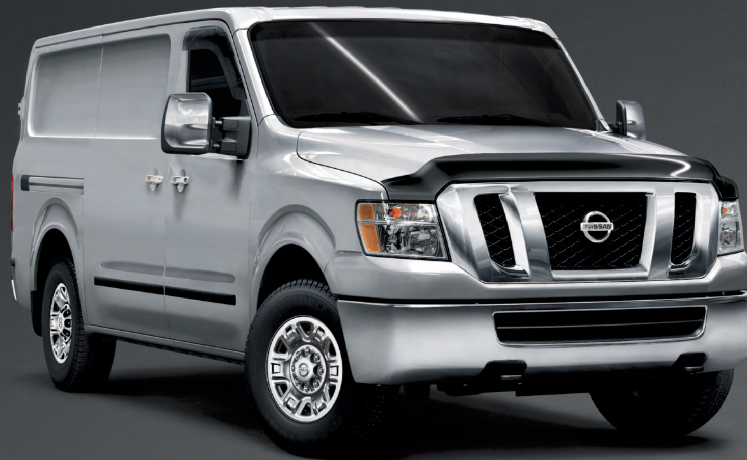
Nissan NV3500 ® HD Cargo Standard Roof SL shown in Brilliant Silver Metallic with Hood Protector, Telescoping Tow Mirrors, Tow Hooks, Side-window Deflectors, Body Side Moldings, and Splash Guards.

For more information and to shop online for NV ® Cargo Genuine Nissan Accessories, go to bit.ly/19nvcargo-estore