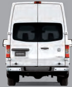
323 CU. FT. CARGO CAPACITY 6