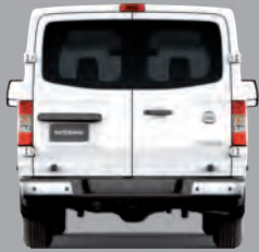
234 CU. FT. CARGO CAPACITY 6