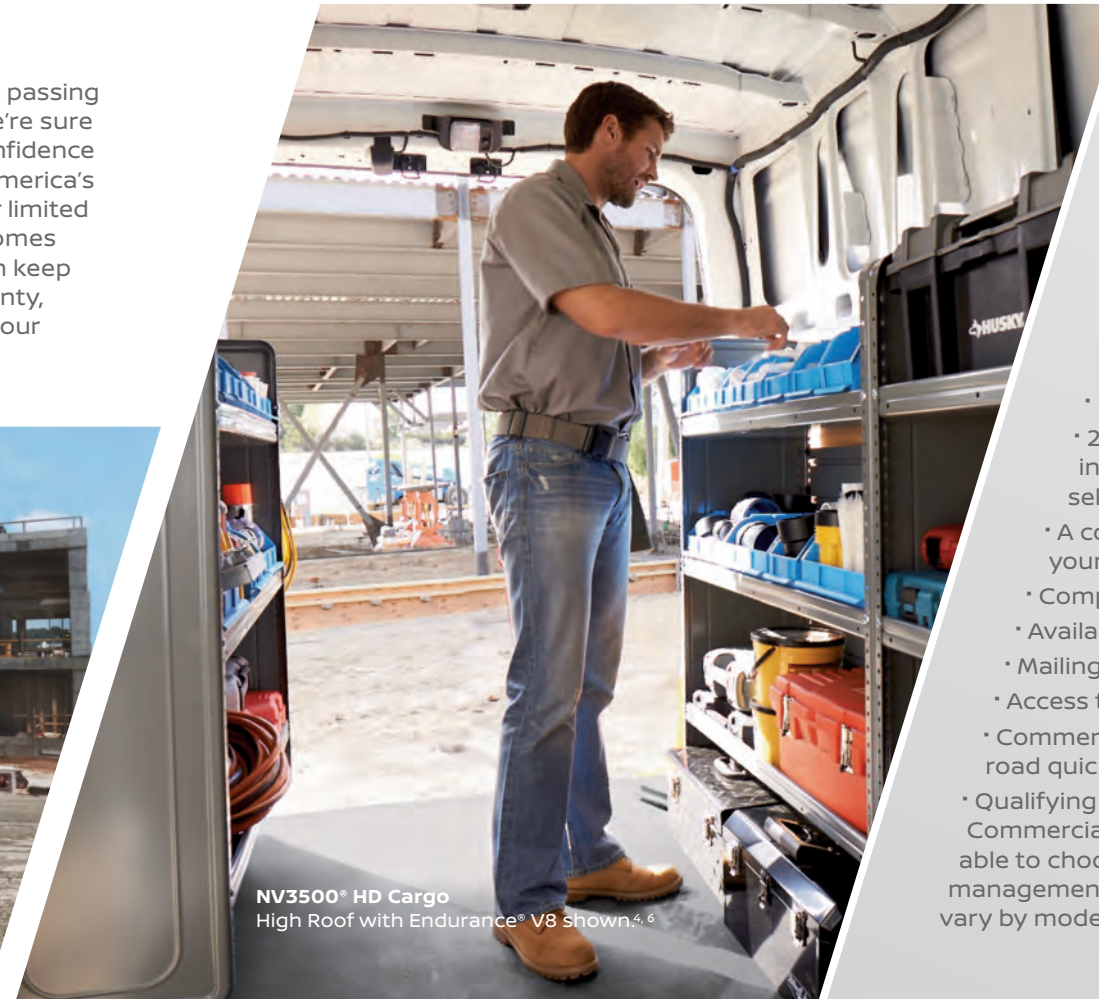
NV3500® HD Cargo High Roof with Endurance® V8 shown. 4, 6