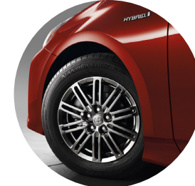
15-in. "Hyper Black" 10-spoke alloy wheels