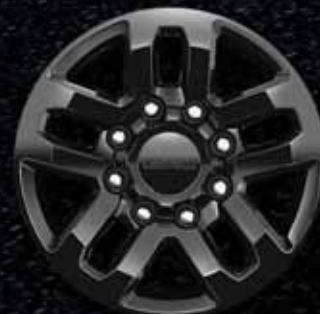
18" Black Painted Aluminum (RT4) Included and Only Available With All Terrain X Package