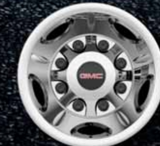
17" Painted Steel With Chrome Overlay (P06) Standard on 3500HD DRW SLE and SLT