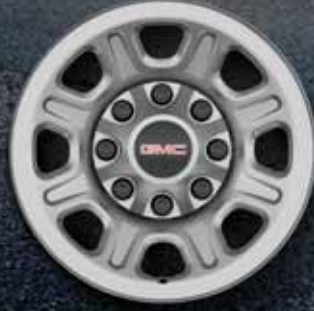
18" Painted Steel (PYT) Available on 2500HD Sierra