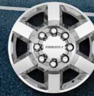
18" Chromed Aluminum (PYR) Standard on 3500 Denali HD SRW; Available on 2500 Denali HD