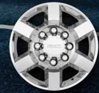
18" Chromed Aluminum (PYR) Standard on 3500HD SRW SLE and SLT; Included on 3500HD All Terrain