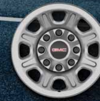
18" Painted Steel (PYT) Standard on 3500HD SRW Sierra