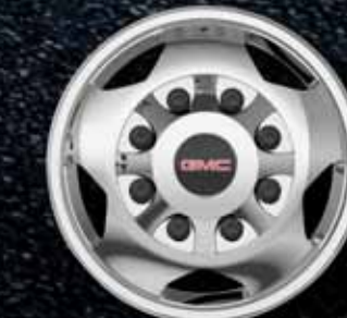
17" Polished Forged Aluminum (RS7) Standard on 3500 Denali HD DRW; Available on 3500HD Crew Cab DRW SLE and SLT