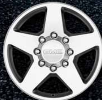
20" 5-Spoke Polished Aluminum With Dark Argent Accents (RTH) Available on 2500HD All Terrain