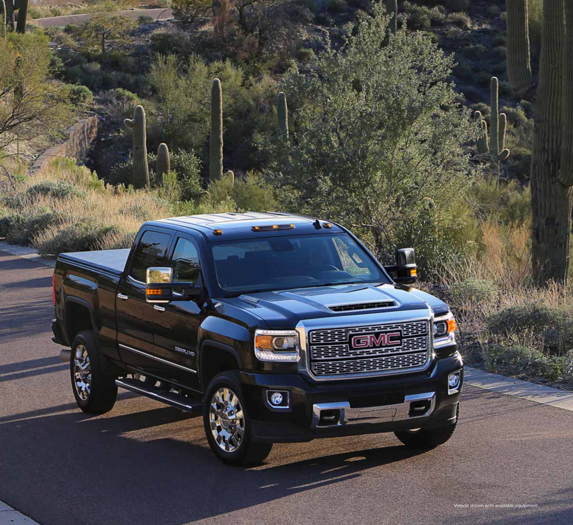
Vehicle shown with available equipment.