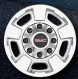
17" Machined Aluminum (PYQ) Standard on 2500HD SLE; Available on 2500HD Sierra