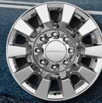
20" Chromed Aluminum (RCA) Standard on 2500 Denali HD