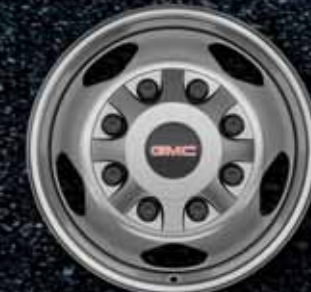
17" Painted Steel (PYW) Standard on 3500HD DRW Sierra