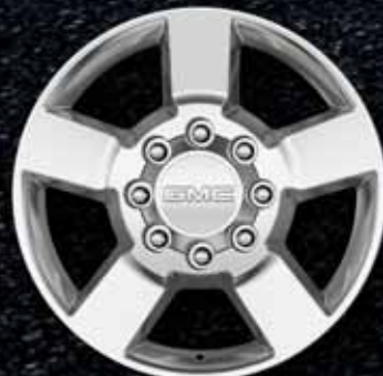
20" 5-Spoke Polished Aluminum (PYU) Available on 2500HD SLE