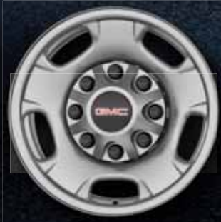
17" Painted Steel (PYN) Standard on 2500HD Sierra