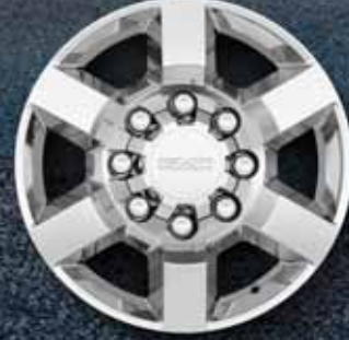
18" Chromed Aluminum (PYR) Standard on 2500HD SLT; Included on 2500HD All Terrain; Available on 2500HD SLE