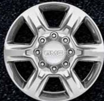
20" 6-Spoke Polished Aluminum (Q7R) Available on 2500HD SLT